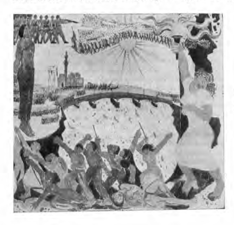
The Fight at the Bridge (The Bagdad Demonstration of 1948)

Peking's people, who turned out in their hundreds of thousands to demonstrate their support for Iraq when the American and British imperialists threatened the new republic at its birth, have taken this exhibition to their heart. It has brought Iraq still nearer to them. It has made a good start in strengthening the cultural ties between the two countries.