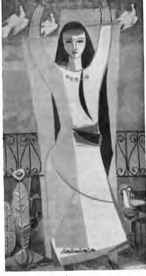
Invitation to Happiness Oil painting by Nuri Arawi

A sketch by Hamid Attar is like a short lyrical poem: a baby is lying fast asleep, with a dove and an olive-branch