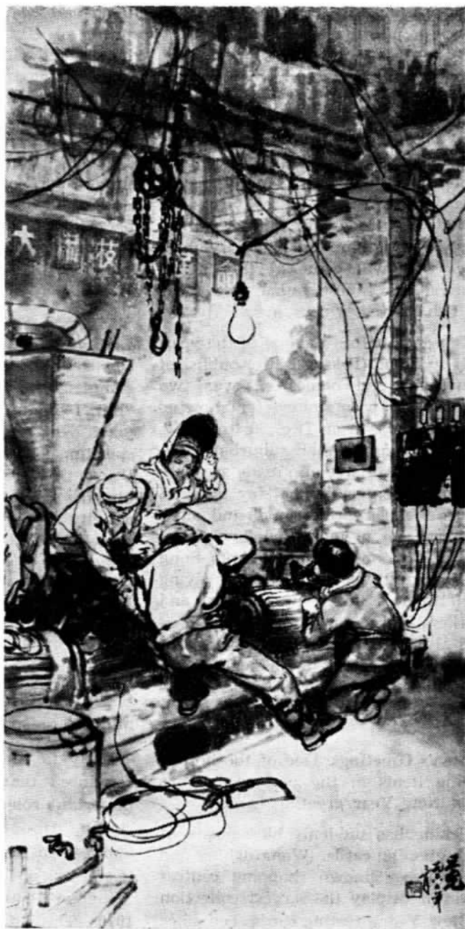
Technical Innovators in a Factory

This year, Shanghai has produced more than 800 types of machines for light industry, about one-third of them for the first time in its history. These include high precision machines and vital equipment for the paper-making, glass, plastics, food, watch-making and other industries.