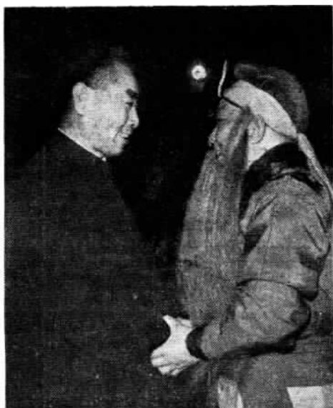
Premier Chou En-lai congratulates Chou Hsin-fang after his performance

Watching a performance by Chou Hsin-fang, one cannot fail to see the profound respect which he has for the traditions of his art. But at the same time it is clear that he is never bound by tradition. He says a good artist must "know his times and the tide of events and understand the psychology of his audience. Mistakes made must be corrected, what needs to be, must be revised and what is resented must be done away with." To do this, he says that an artist must "be able to express the true meaning of the libretto, or to create and impart to it a new meaning." In accordance with this principle, he has brilliantly re-