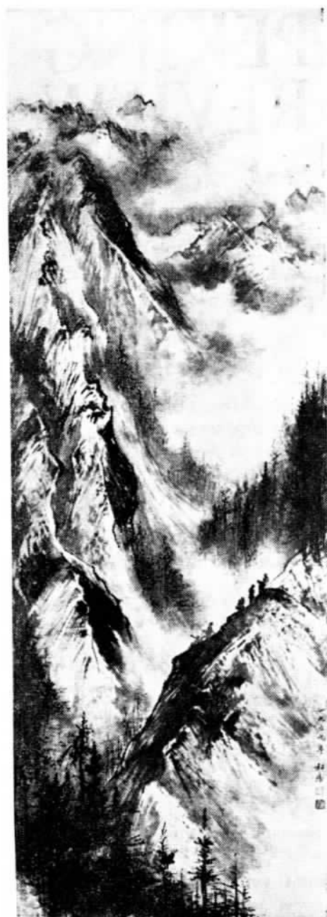
Surveying Team Among the High Mountains