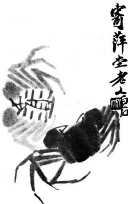
By Chi Pai-shih

The letter ends like this: "Our shoes are a new product. You may find faults in them that escaped our notice. Please send us your criticisms or suggestions for improvement. If the sole gives out in normal wear before the rest of the shoe, return it to us with your comments. We will gladly replace it with a new pair. . . ."