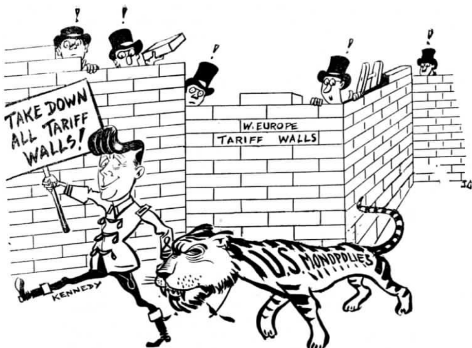
Kennedy's Pal Is Hungry

A number of industrial branches did register considerable increases. There were the ones most closely connected with war production, among them were electrical machinery, chemicals and aeroplanes. The production in-