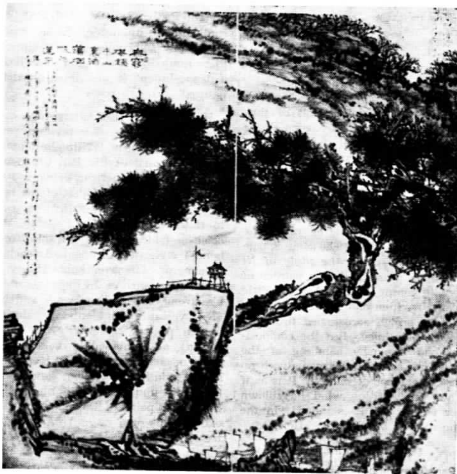
Fleet Transports Sail the Misty River

*The Mi school is represented by Mi Fei (1051-1107 A.D.) and Mi Yu-jen (1086-1165 A.D.), father and son, well known for their delicate renderings of mountains and trees wreathed in clouds and mists.