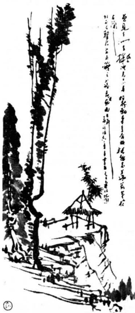
Landscape in the Style of Ni Yun-li

with the typical dot strokes of that school of painting, but by using steely white space instead of the traditional light ink wash to represent the mists and fogs clouding the waist of the mountains, he succeeds in giving the picture a metallic note which is emphasized again in the colophon as "The thousand mountains after rain look like fresh cast iron." The same is true of his Landscape in the Style of Ni Yun-li (a great landscape painter of the 14th century). This has the little isolated pavilion and the scrawny tree we have grown accustomed to seeing in such paintings. But the composition and the new handling of the brushwork certainly leaves us with no sense of chill or desolation. It is as if a new invigorating wind has blown over the scene. It is indeed "in the style of Ni," but with a difference.