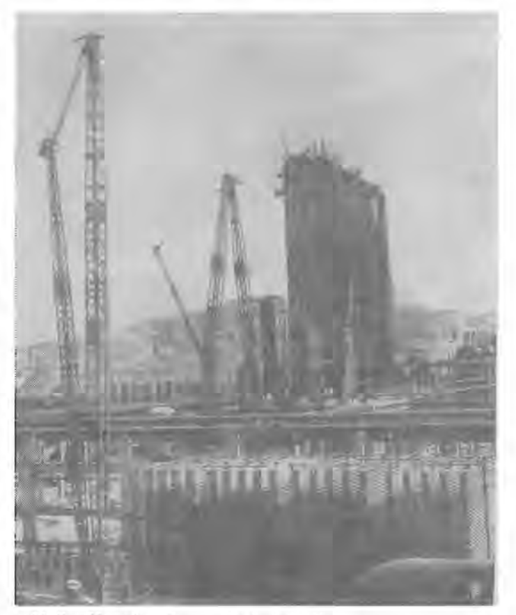
At the Maanshan Iron and Steel Works. A new benzene section being built for the recovery shop of the coking plant

Among the 60-odd key metallurgical projects now being constructed are two giant open-cut iron-ore mines, a big iron-ore shaft mine and a big magnesium mine. All are for the Anshan Iron and Steel Works, China's leading metallurgical centre in the northeast. The Penki Iron and Steel Works, also in the northeast, is building a modern limestone quarry and an open-cut iron-ore mine. Both projects are designed by Chinese personnel and will