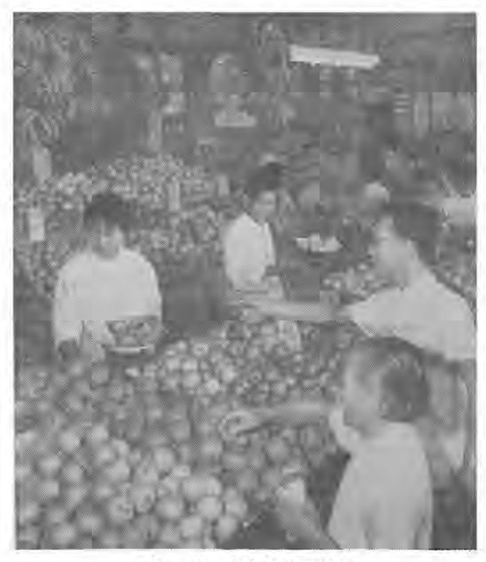
At a Shanghai fruit market

Szechuan peasants are also buying more farm implements, fertilizers and draught animals. The supply and marketing co-ops sold more than 4,300,000 farm tools for use in the three main autumn tasks: harvesting, ploughing and sowing.