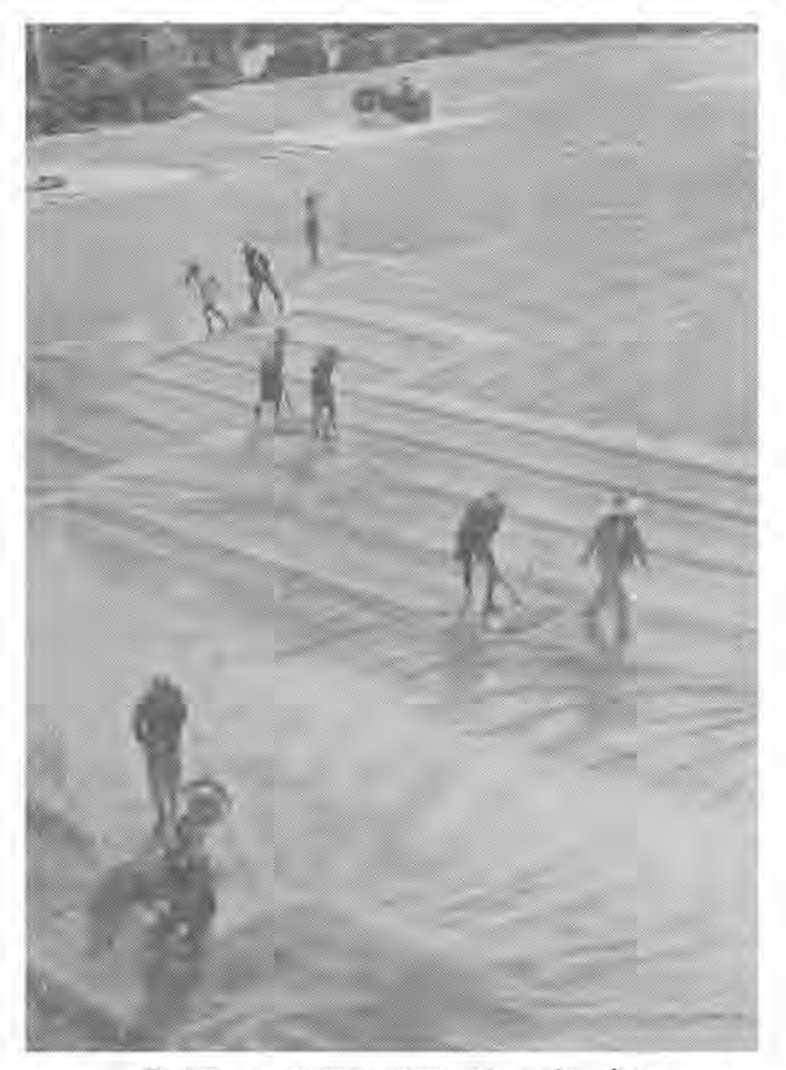
Drying a bumper crop of early rice in Chungshan County, Kwangtung Province

Harvesting of the autumn crops has virtually been completed in Szechuan Province, China's leading rice producer. A majority of regions report better crops than last