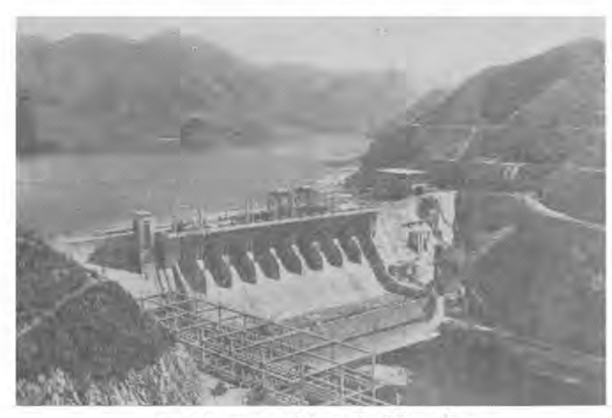
The hydropower station on the Hsinan River

China's plastics industry is growing by leaps and bounds. Twenty per cent more plastic goods were produced in the first eight months of the year in comparison with the corresponding January-August period in 1962. The