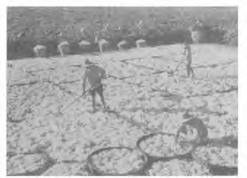
Harvesting an exceptionally good cotton crop on a Chekiang commune

Yellow River valleys, on the lower reaches of the Liao River in the northeast and from the inland cotton belt in the northwest. Many areas are harvesting the best cotton crop in years. Hupeh, Chekiang, Kiangsu and Kiangsi Provinces on the middle and lower reaches of the Yangtse have lived up to their reputation as high-yielding cotton areas. The cotton crops gathered thus far in Kiangsu, Chekiang, Anhwei, Hupeh and Shensi Provinces show increases of from 100 to several hundred per cent. Even the traditionally low-yielding and newly developed cotton areas are bringing in good harvests.