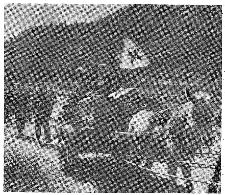
A mobile hospital of Chingyuan County, Shansi Province, on its rounds

for urban medical workers to tour the countryside. Health workers in many of our cities have taken it as their duty to go down to the countryside in the busy farming seasons. Others made regular and more frequent visits and longer stays during the great drives to wipe out schistosomiasis and malaria in places where these diseases were prevalent. But this is the first time that they have organized their tours on such a big scale to cover such vast areas and to involve such large numbers of health and medical workers at all levels, from leading specialists to ordinary practitioners, students and nurses.