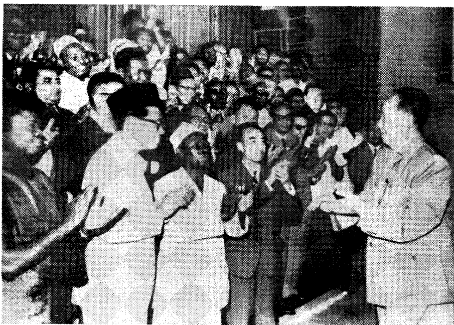
The delegates and observers greet Chairman Mao