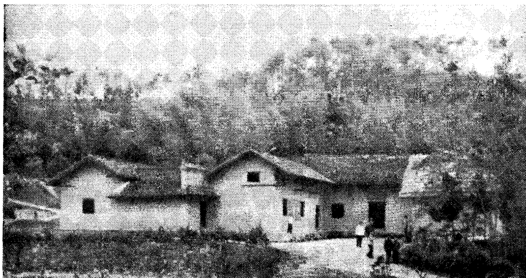
Chairman Mao's birthplace

Filled with noble belief in Chairman Mao and showing boundless love for him, all friends from the