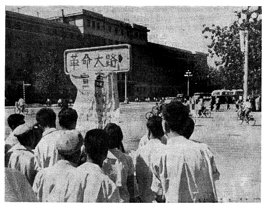
A poster put up on a street sign by Peking's Red Guards proposing a new name for the street

In "The Great World," the biggest amusement centre of Shanghai, workers and staff together with the