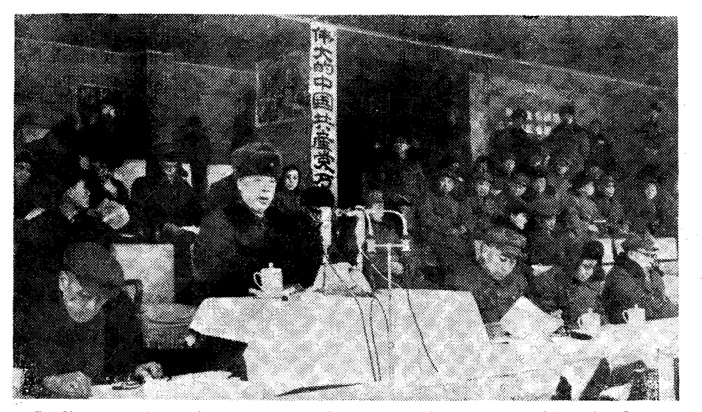
Leading comrades of the Central Committee of the Chinese Communist Party Chou En-lai (3rd. from r.), Chen Po-ta (r.), Kang Sheng (l.), Chen Yi (addressing the rally) and Chiang Ching (2nd. from r.) at the rally

on still more vigorously and successfully with the great proletarian cultural revolution and, with the new victories won in this revolution, repulse the wild attacks of Soviet revisionism. Together with the revolutionary people of the world, they will carry through to the end the struggle against imperialism with U.S. imperialism at the head and against modern revisionism whose centre is the leading clique of the Communist Party of the Soviet Union.