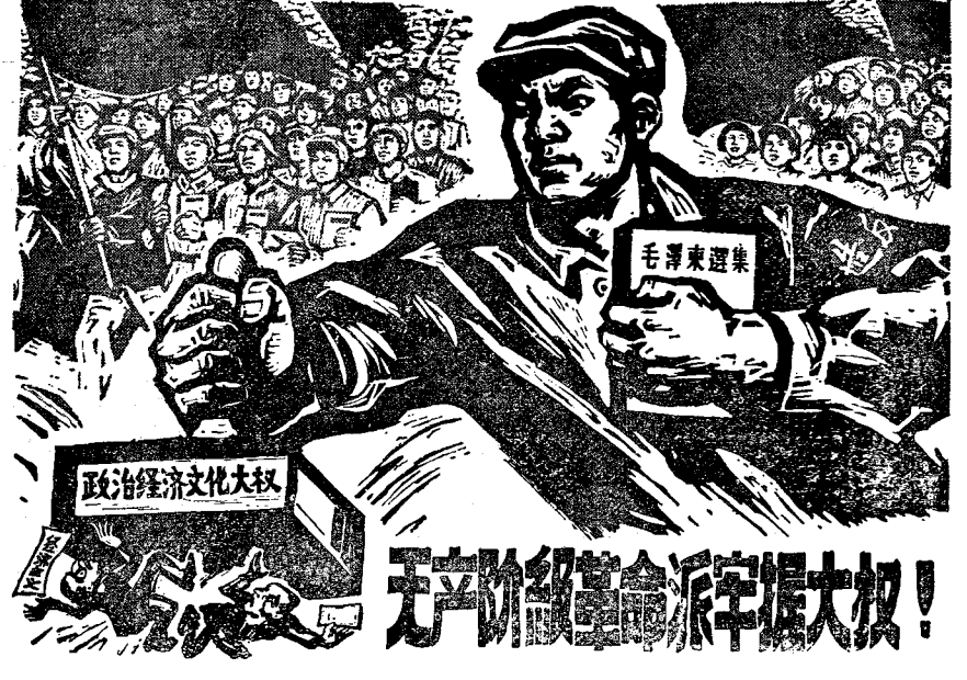
Proletarian Revolutionary Rebels! Get a Firm Grip on Power! A poster of today showing a revolutionary rebel holding fast a copy of Mao Tse-tung's works in one hand. With the other, he is wielding political, economic and cultural power to stamp out the class enemy.

Chairman Mao says: "The fundamental cause of the development of a thing is not external but internal; it lies in the contradictoriness within the thing." The red rebels in Heilungkiang Province hold that an important factor behind the victorious seizure of power is the reliance on the genuine revolutionary rebels in every unit and department and the concerted efforts of the internal and external forces. This has been proved by the experience in the seizure of power in the Provincial Party Committee as well as by the experience