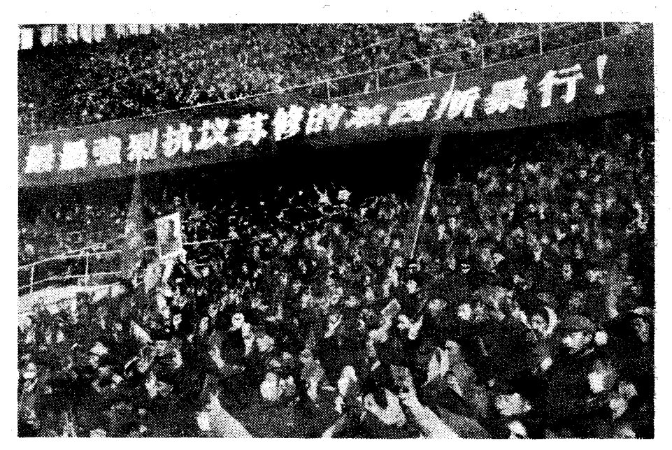
Part of the rally of revolutionary masses

The representative of the returned students mounted the rostrum after the statement had been read. He indignantly indicted the Soviet revisionist ruling clique for the crime of bloodily suppressing the Chinese students who laid wreaths at the Lenin Mausoleum and Stalin's tomb on January 25. It was no accident, he said, that a series of shocking anti-China incidents involving bloodshed had taken place in the Soviet Union. It was completely master-minded and deliberately engineered by the Soviet revisionist ruling clique. No one but Brezhnev and Kosygin were the arch-criminals who stage-managed these vile anti-China antics. The fascist atrocities of the Soviet revisionist ruling clique show (Continued on p. 19.)