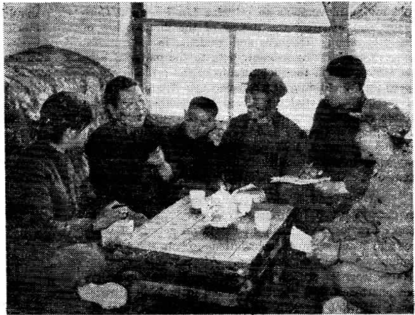
Worker-peasant-soldier students of Peking University making social investigations in the countryside.

Using Marxism to Occupy Various Branches of Study. Teachers and students have made great efforts to use Marxism to occupy various branches of study. This has brought great changes to the teaching content. In the field of philosophy and social sciences they have adhered