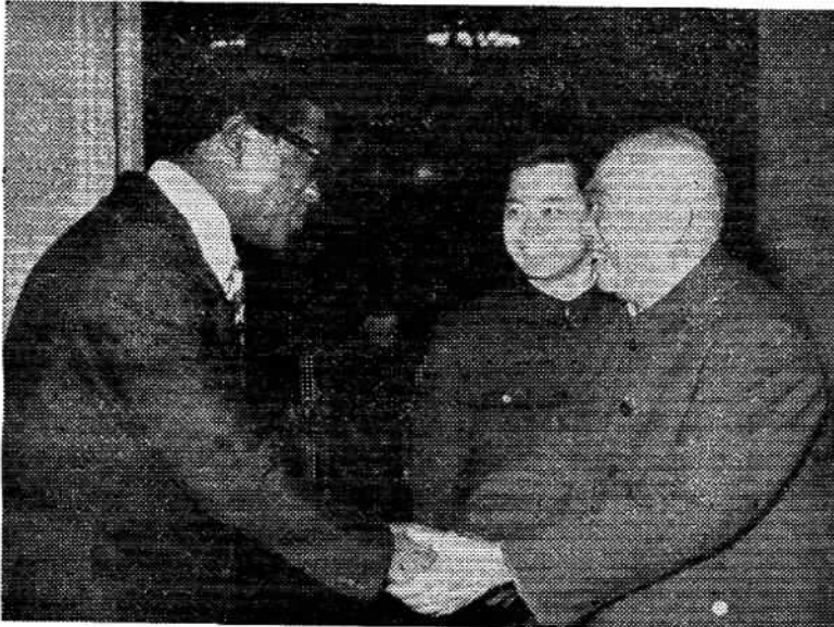
Chairman Chu Teh of the Standing Committee of the National People's Congress shakes hands with President Manuel Pinto da Costa.

On behalf of Premier Chou En-lai, Vice-Premier Li extended a warm welcome to President and Madame Manuel Pinto da Costa on their visit.