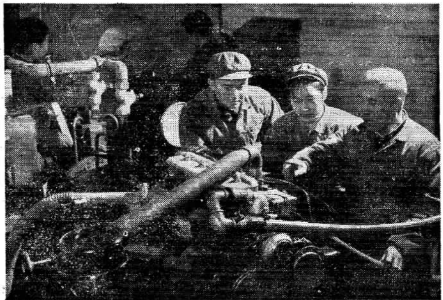
The high-speed diesel engine successfully produced by Tsinghua worker-peasant-soldier students together with the workers and teachers of the university-run factory.

The teachers and students also studied the methods used by the local people to prevent soil erosion on the loess plateau in the northern part of Shensi Province.