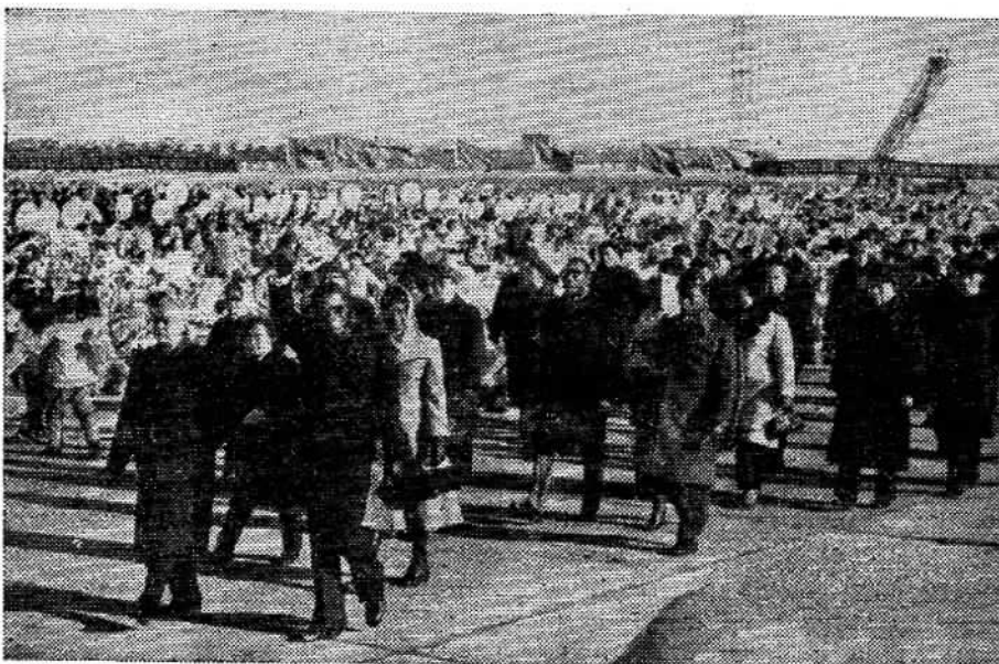
President and Madame Manuel Pinto da Costa warmly welcomed at Peking Airport.

A grand welcome ceremony was held at the airport. Accompanied by Chinese leaders, President Manuel Pinto da Costa reviewed a guard of honour of men of the ground, naval and air forces of the