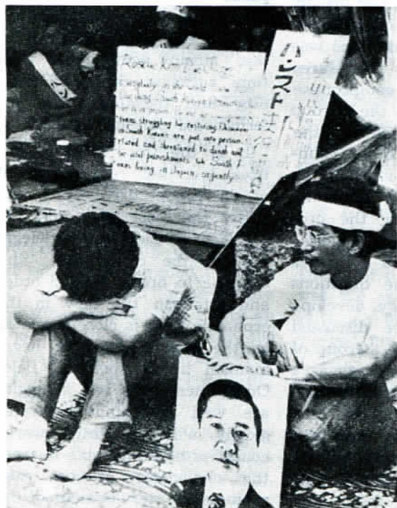
South Koreans in Japan on a hunger strike demanding release of Kim Dae Jung.