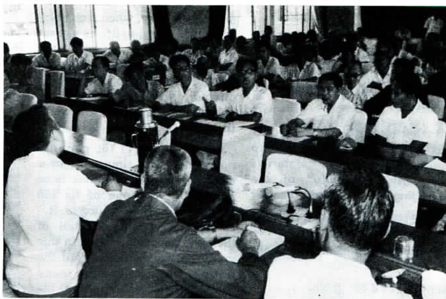
N.P.C. deputies (facing camera) addressing inquiries to officials in charge of the State Bureau of Labour and the State Bureau of Commodity Prices.

This is another major issue decided on at the session after full deliberations. Hua Guofeng's speech has indicated the orientation: Overcentralized management by the state must be corrected and the decision-making power of enterprises and the power of workers and staff to participate in management extended; regula-