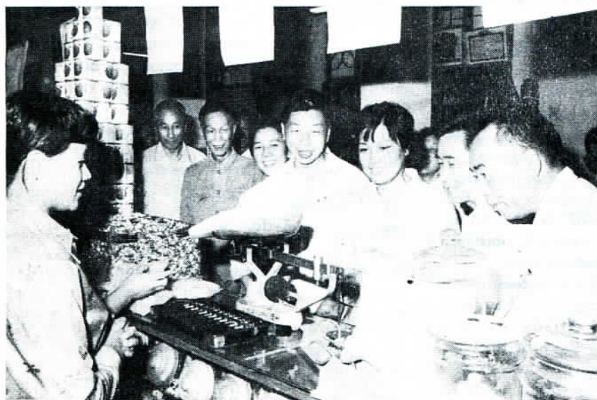
Deputies of a district in Shanghai checking on the prices and quality of goods in a shop.

and suggestions regarding the shortcomings and other problems in the work while affirming its achievements. Some criticized certain localities for arbitrarily raising commodity prices and issuing excessive bonuses. They demanded that the government departments concerned tighten price control and put an end to the abuses in the granting of bonuses and the increasing of prices. Some Standing Committee Members sharply criticized certain localities which had for a