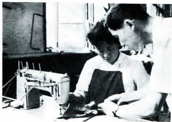
Co-operation between a leather sporting goods factory in Shanghai and a tannery in southwest China's Sichuan Province. Picture shows a technician from Shanghai helping a worker in the tannery master new techniques.

Following recent complaints from both Chinese and foreign passengers, the General Administration of Civil Aviation of China (CAAC) is now taking