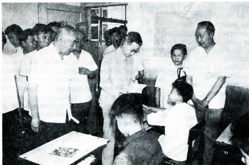
N.P.C. Standing Committee Members inspecting a work-study school in Beijing.

The present revised draft of the Marriage Law of the People's Republic of China was drawn up on the basis of the Marriage Law promulgated in 1950.