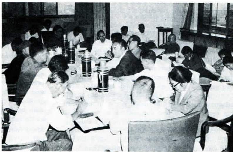
Tibetan deputies at a panel discussion.

A Session Where All Deputies Are Equal. The way the meetings were held was not the same as before. In the past, deputies holding leading posts would mount the rostrum only after all other deputies had taken their seats and they would receive a standing ovation with all the lights in the auditorium on. This time they just walked into the hall and took their seats about the same time as the others. At the back of the rostrum was the emblem of the People's Republic, replacing the leaders' portraits which used to dominate the scene. Ranking officials now took part in group deliberations like everybody else. In the past, they were supposed to belong to different groups of deputies, and they just didn't join the deliberations as ordinary deputies but would appear as leaders who came down to "meet their fellow deputies" or "give instructions." All these may appear to be mere trifles, but it was these details that testified to the new spirit of the session. Congress members had the feeling that the wall between them and the leaders was being pulled down to let the breezes of democratization blow in.