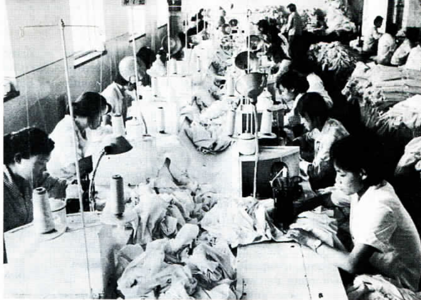
A collectively owned clothing factory in Weihai city, Shandong. Many such enterprises have been established to open up more avenues for employment.

(4) Funds devoted to developing agriculture and light industry were increased by a fairly big margin. This helped to readjust the