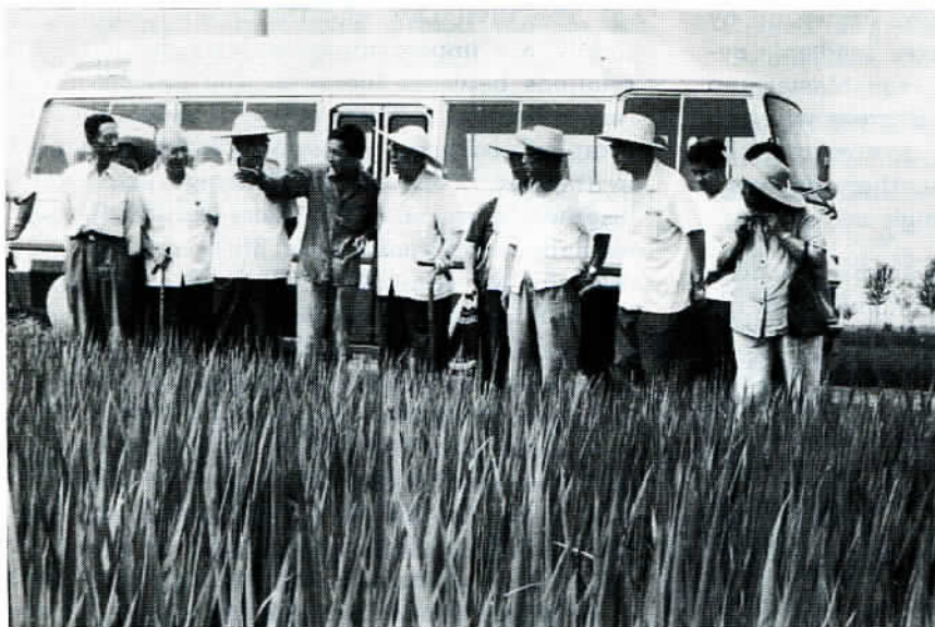
N.P.C. Standing Committee Members inspecting a farm in Beijing.

over the past few years, there are still a lot of problems and divergences of opinions among the various quarters. Conditions are not ripe for making a family planning law now, nor for submitting the draft to this session. What we have done in this connection is only to stipulate in the revised Marriage Law that both husband and wife have the obligation to practise family planning and that late marriage and late childbirth are encouraged. We shall continue to sum up experience and canvass opinions from all sides so that a family planning law may be enacted as soon as possible.