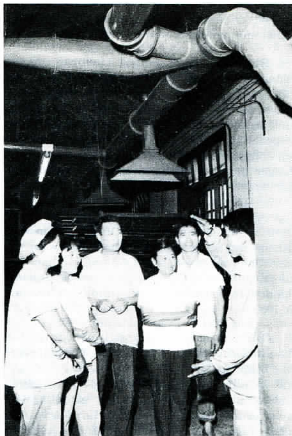
People's deputies of a district in Shanghai inspecting a furniture factory which has taken measures to reduce air pollution.

partments at all levels are required to draw up, in the light of the actual conditions, specific plans to enforce the Law of Criminal Procedure within this year in stages and in a number of localities at a time throughout the areas under their jurisdiction, with the exception of a very few outlying areas where the date of enforcement of the law may be postponed appropriately owing to exceedingly difficult communications.