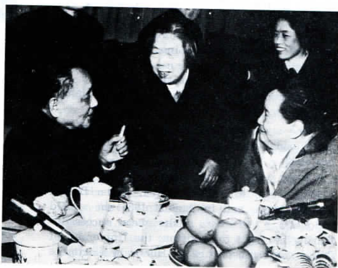
Comrade Soong Ching Ling chatting with Comrades Deng Xiaoping and Deng Yingchao at the tea party given on 1980 New Year's Day by the National Committee of the Chinese People's Political Consultative Conference.