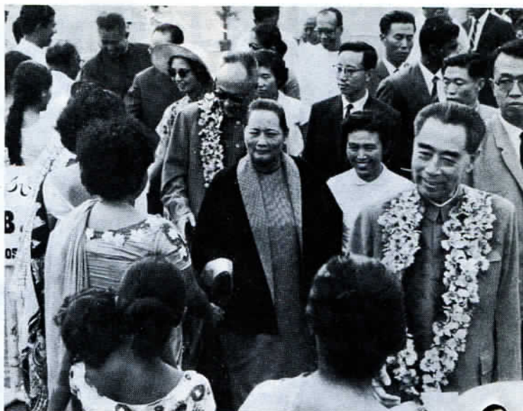
Comrades Soong Ching Ling, Zhou Enlai and Chen Yi on an official visit to Sri Lanka in February 1961.