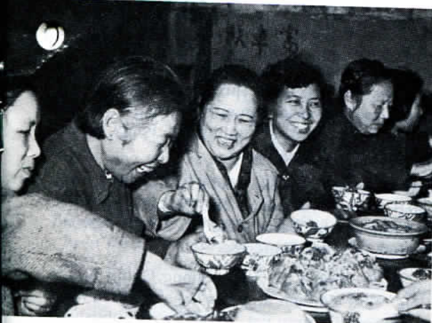
Dining with workers during an inspection tour of the Shanghai No. 17 State Cotton Mill in October 1958.