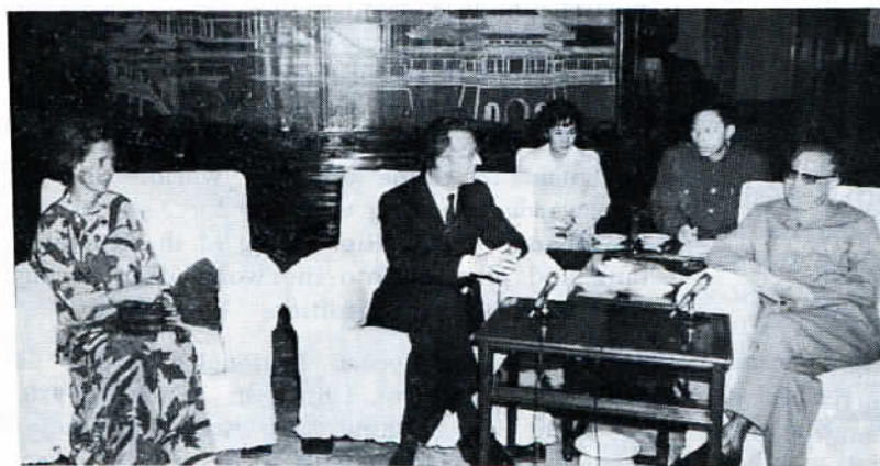
Premier Zhao Ziyang with the Belgian King and Queen.

Condolences on President Aguilera's Death. On behalf of the Chinese Government and people, Premier Zhao Ziyang on May 26 sent a message extending condolences to the Ecuadoran Government and people on the death of Jaime Roldos Aguilera, President of the Republic of Ecuador, in a plane crash.