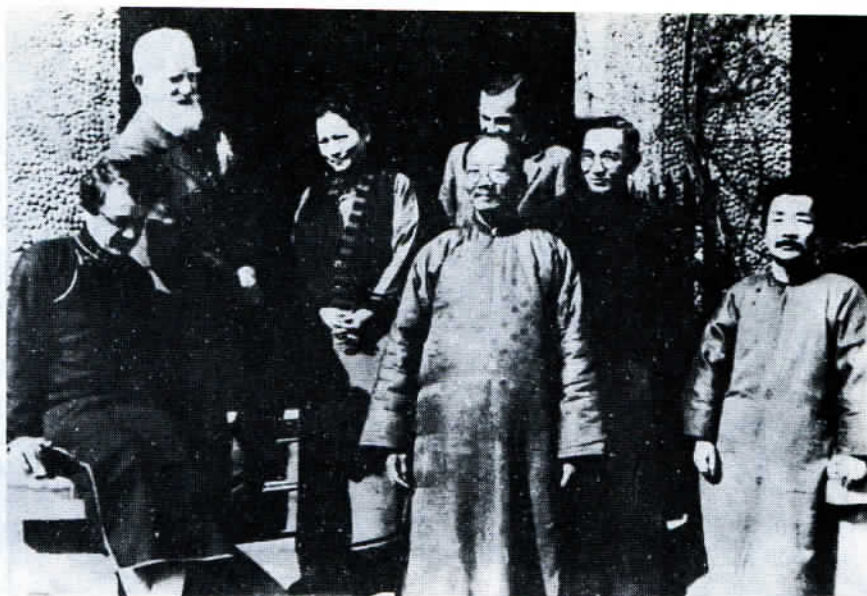
Comrade Soong Ching Ling gave a party in honour of British writer George Bernard Shaw at her home on February 17, 1933. In the front row from the left: U.S. journalist Agnes Smedley, well-known modern Chinese educator Cai Yuanpei, and China's renowned modern writer Lu Xun. In the back row from the left: George Bernard Shaw, Soong Ching Ling, U.S. journalist Harold Isaacs and writer of modern Chinese prose Lin Yutang.