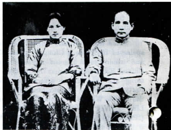
Dr. Sun Yat-sen and Madame Soong Ching Ling in September 1917 after he had assumed the post of Generalissimo of Navy and Army.