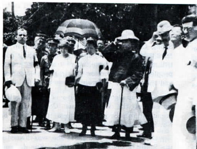
Dr. Sun Yat-sen (fourth from left) and Madame Soong Ching Ling (third from left) at the memorial meeting mourning Lenin's death in Guangzhou in February 1924.