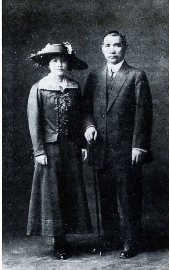
Dr. Sun Yat-sen and Soong Ching Ling in Japan in 1915.

In November 1924, Soong Ching Ling accompanied her husband north to Beijing at the invitation of military and political leaders there to solve the problems of China's reunification and construction. Sun Yat-sen died on March 12, 1925, in Beijing. After his death, Soong Ching Ling made known to China and the world Dr. Sun Yat-sen's political will and dedicated herself to the great revolution of the Chinese people.