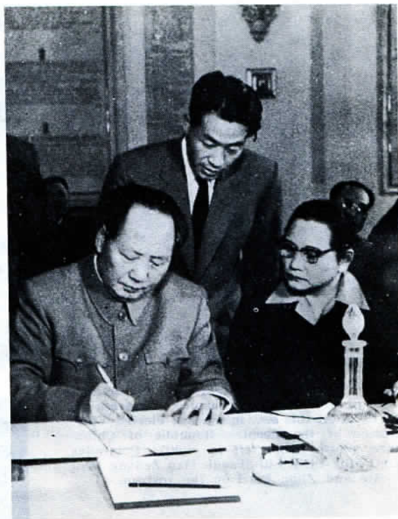
At the Moscow Meeting of Representatives of Communist and Workers' Parties in 1957.

In December 1954, she was elected Vice-Chairman of the National Committee of the