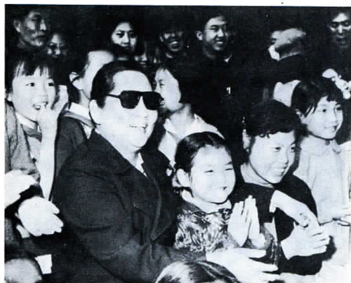
Comrade Soong Ching Ling together with children in 1962.