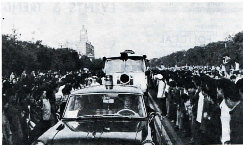
A procession along Changan Boulevard on June 2 escorting the body of Comrade Soong Ching Ling to a crematorium.