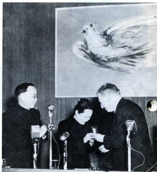
Comrade Soong Ching Ling being awarded the 1950 Stalin Peace Prize. She donated the entire prize money to welfare institutions for Chinese women and children.