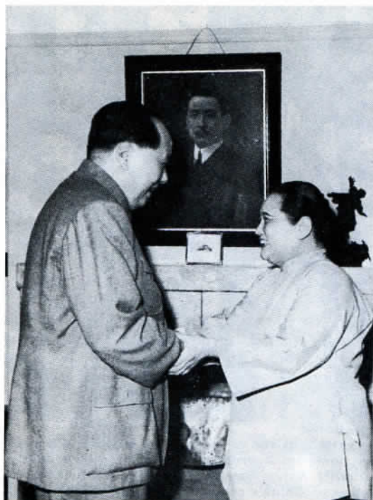
Chairman Mao Zedong visiting Comrade Soong Ching Ling at her Shanghai home in May 1961.