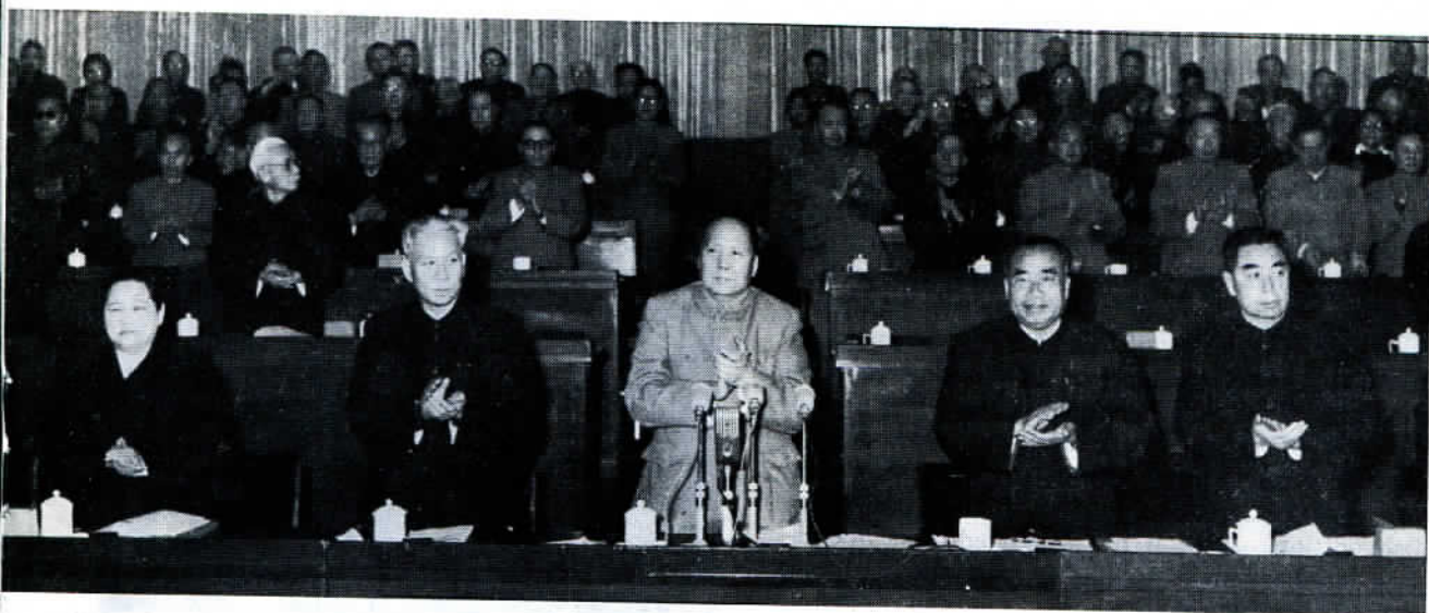
Comrade Soong Ching Ling at the First Session of the Second National People's Congress in April 1959. At this session she was elected Vice-Chairman of the People's Republic of China. Picture shows (from left to right): Comrades Soong Ching Ling, Liu Shaoqi, Mao Zedong, Zhu De and Zhou Enlai on the rostrum.