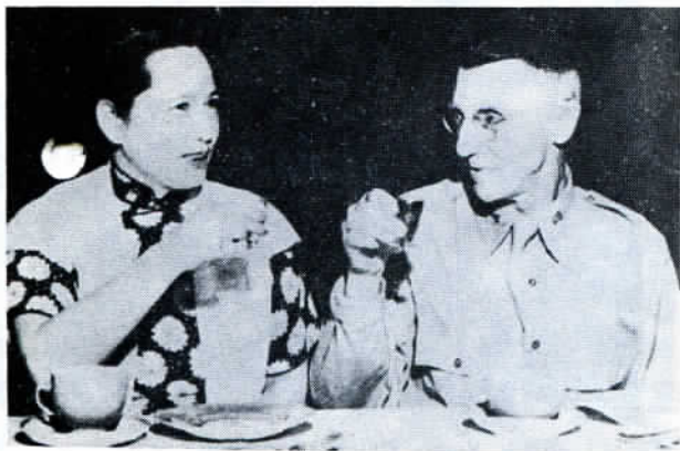
During World War II, Comrade Soong Ching Ling met with U.S. General Joseph Stilwell in Chongqing who was in charge of the Chinese-Indian-Burmese War Zone. The general held that all forces resisting Japanese aggression should be treated equally in order to ensure a victory in the War of Resistance Against Japan.