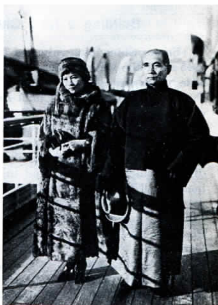
Dr. Sun Yat-sen and Madame Soong Ching Ling on board the ship from Guangzhou to Tianjin after Dr. Sun Yat-sen issued a manifesto reiterating his opposition to imperialism and the warlords in November 1924.