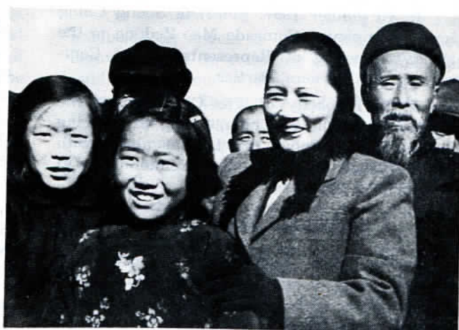
Comrade Soong Ching Ling with peasants during her inspection tour of the suburbs of Changchun in October 1950.