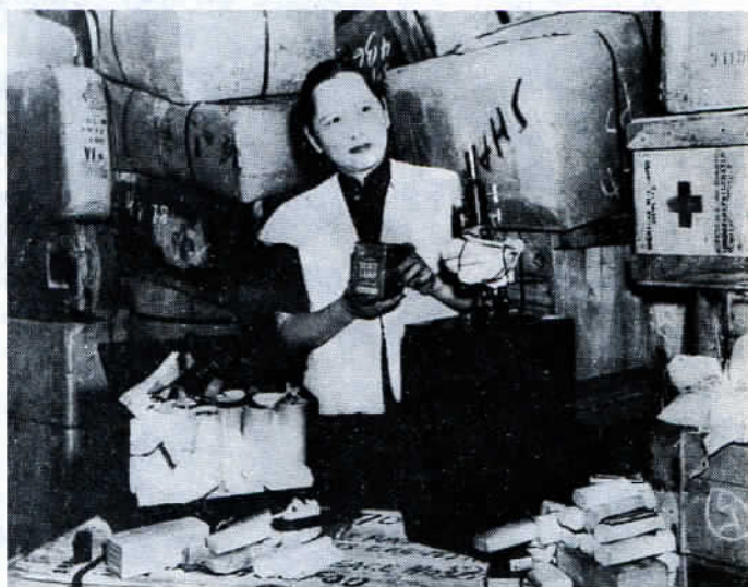
Checking medical supplies collected by the China Welfare Fund in 1948 for the liberated areas under the Chinese Communist Party.