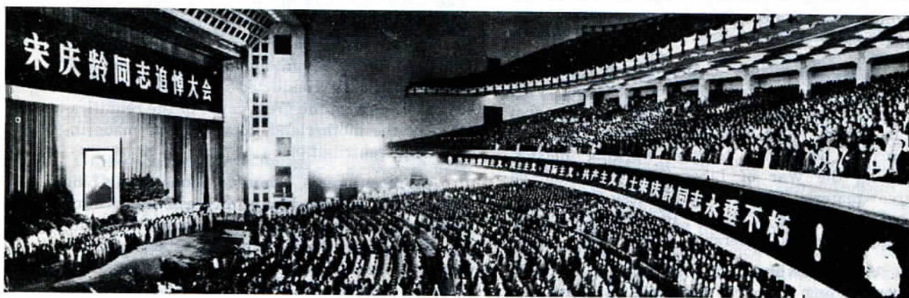
At the memorial meeting.

After the September 18th Incident in 1931, Japanese troops invaded and occupied China's three northeastern provinces and the Kuomintang government pursued a policy of non-resistance. In 1934, the Chinese Communist Party put forward a Six-Point Programme for Resisting Japan and Saving the Nation which was promulgated over the signatures of Com-