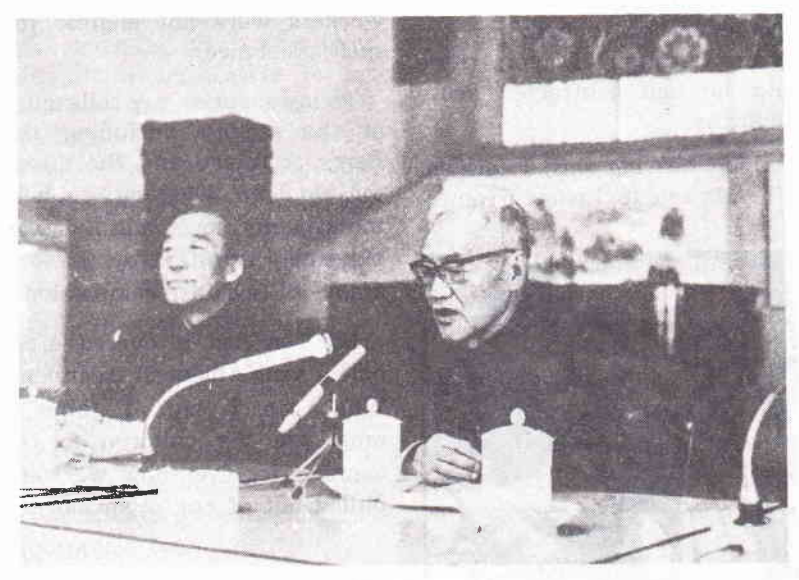
Ba Jin (right).

Since the Fourth National Congress of Writers and Artists held at the end of 1979, a con-