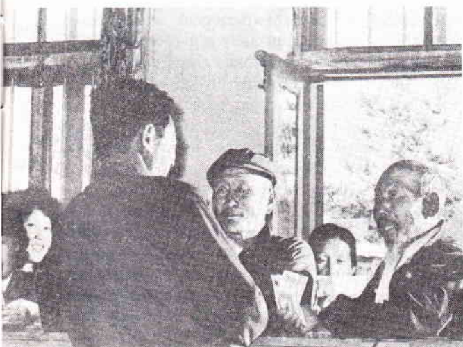
Each member of a commune in Huma County, Heilongjiang Province, has an average of 388 yuan in bank savings.

In socialist construction we aim at achieving the maximum in economic results at the minimum of cost so as to ensure the sustained growth of production and a gradual improvement in the people's living standards. As our progress was retarded by the 10 years of turmoil, our economy is still rather backward, and we must redouble our efforts to speed up production. With our huge and rapidly growing population and limited construction funds, our need for meticulous calculation is all the greater if our funds are to be used so as to yield the optimal economic results and if we are to completely eliminate waste and get rid of all unhealthy tendencies. Otherwise, our socialist construction will be retarded, and it will be difficult to achieve a high level of socialist cultural development. If the above problems in production, construction and circulation are conscien-