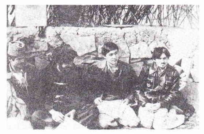
Three students who crossed the Soviet border to join the Afghan resistance movement.

Hekmatiyar said resistance troops have become better equipped with weapons captured from Soviet troops and have become more combat experienced. But because of the absence of a unified leadership and shortages in arms and manpower, he added, resistance troops are unable to defeat concentrated enemy forces.