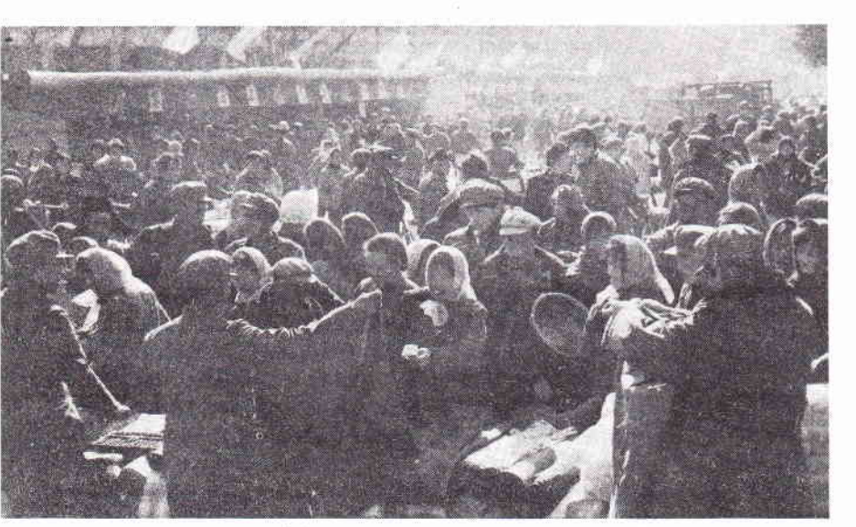
Commercial workers in Tianjin often go to the countryside to sell industrial products.

in government offices and scientific, cultural, educational and public health departments where no bonus system is practised. As of October this year there have been increases in pay first for teachers and staff in primary and secondary schools and for a section of the medical and physical culture workers. Owing to our limited financial resources, it will be only in the next two years that other personnel will successively get pay raises. By the end of 1981, the state will have provided jobs through various channels for 8 million of our urban youth. Urban public facilities and housing projects continue to increase, with a total