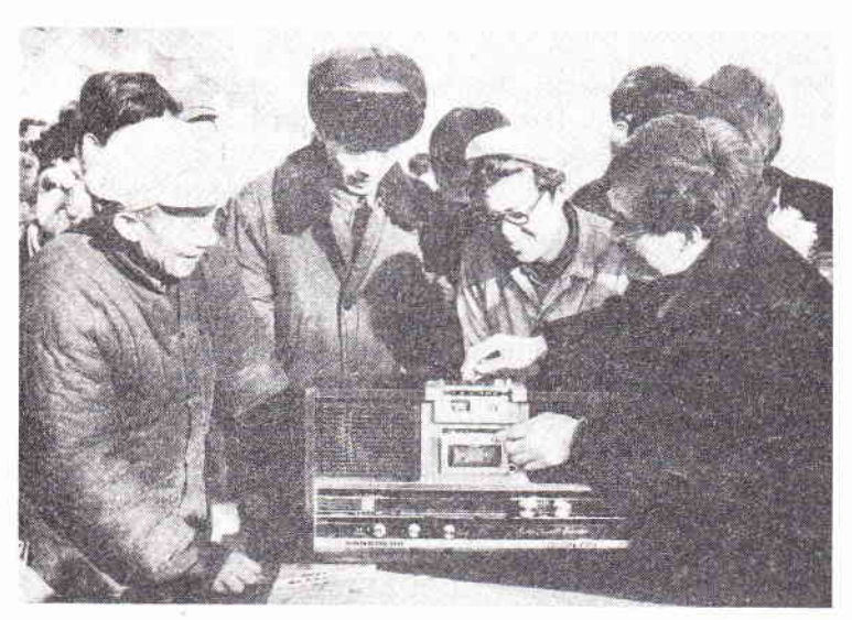
Peasants in the suburbs of Beijing are buying tape-recorders.

to the Standing Committee of the National People's Congress for examination and approval.