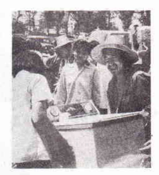
Peasants on the outskirts of Beijing buying washing machines.

Gist of a letter of selfcriticism by the army writer Bai Hua, and a synopsis of his film script Unrequited Love (p. 29).