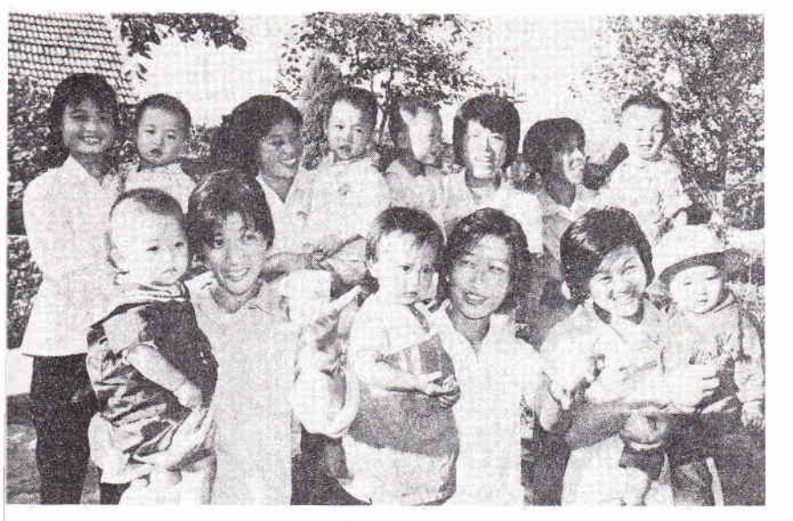
All the women of childbearing age in Nanche Production Brigade in Rongcheng County, Shandong, have volunteered to have only one child.

After liberation, the socialist system brought about an upswing in our economy and a rapid population growth.