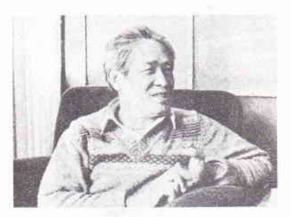
Bai Hua at the recent council meeting of the Chinese Writers' Association.

The Party, the nation and the people suffered together in those tumultuous years of the "cultural revolution" and showed love and concern for intellectuals, he wrote. "It is this love, developed in common fate, that provides the source of strength for the intellectuals to deepen