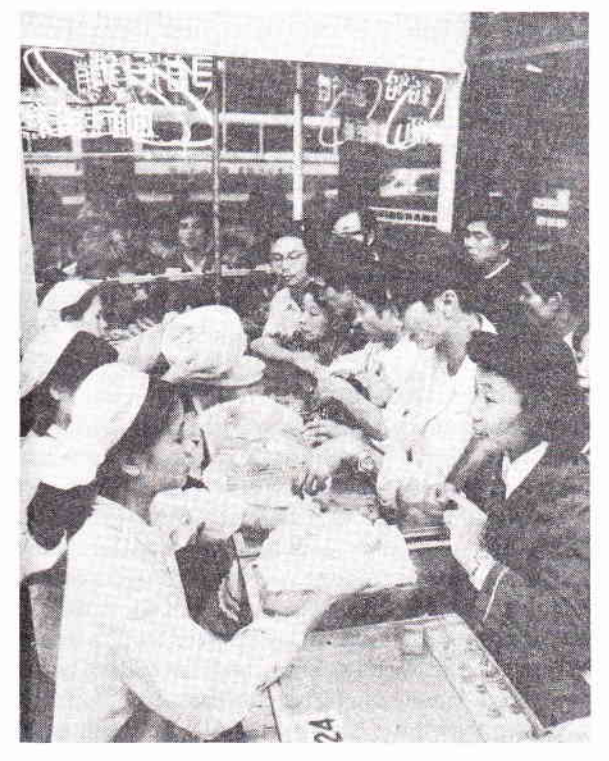
A corner of a Shanghai market.

Total expenditures for 1981 should be 108.58 billion yuan, or 102.8 per cent of the estimate. Of this sum, domestic expenditures should amount to 100.58 billion yuan, or 103 per cent of the estimate, and capital construction appropriations drawing on foreign loans to 8 billion yuan, or 100 per cent of the estimate. The breakdown for domestic expenditures is essentially as follows: 25.06 billion yuan, or 103 per cent of the estimate, for capital construction appropriations; 5.83 billion yuan, or 115.9 per cent of the estimate, for tapping the potential of existing enterprises and for financing their technical transformation and the trial manufacture of new products; 7.3 billion yuan, or 98.5 per cent of the estimate, for aiding people's communes and financing other agricultural undertakings; 17 billion yuan, or 106.6 per cent of the estimate. for culture, education, public health work and science; and 16.87 billion yuan, or 101.2 per cent of the estimate, for national defence and preparations against war. Administrative expenses should reach 7.24 billion yuan, or 121.3 per cent of the estimate. This item will be significantly larger than the estimated figure mainly because improvements in public security, procuratorial and judicial work and the transfer of military officers to civilian jobs have entailed an increase