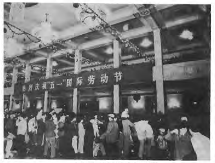
In the Great Hall of the People.

Yang said the CPC Central Committee has decided that its members, members of the Central Advisory Commission and the Central Commission for Discipline Inspection and CPC members in Party or government leadership positions will