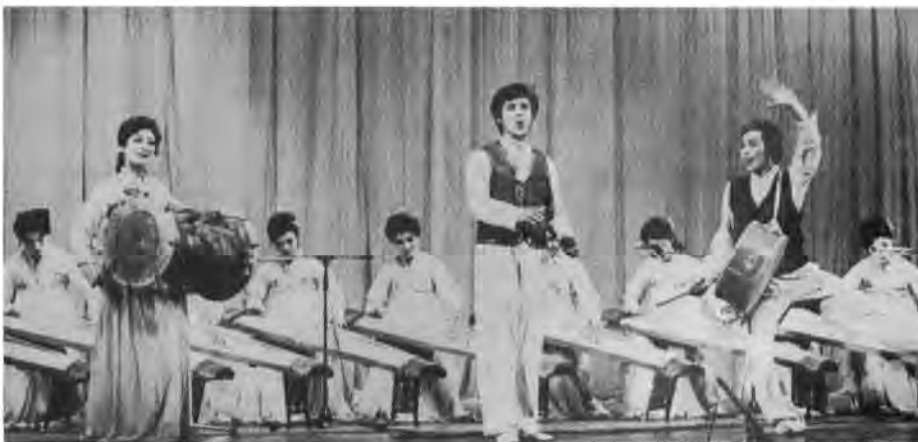
Left: "Song of Herdsmen." Right: Korean music.