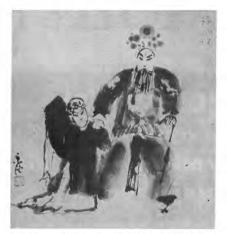
A scene from "Beside the Fenhe River."