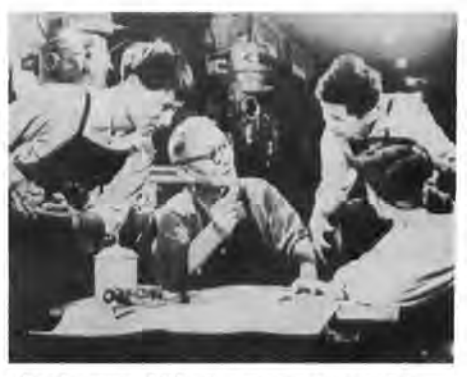
Passing on skills to a new generation.

The prestigious Central Nationalities Song and Dance Ensemble celebrated its 30th birthday in Beijing by presenting a diverse programme (p. 25).