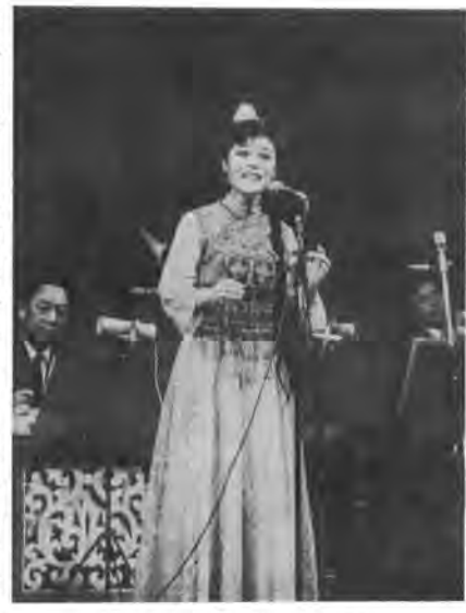
A young Yugur singer.

Each of China's 55 minority nationalities has its own cultural heritage and art. However, as recently as 30 years ago, many minority peoples in border and mountainous areas lived isolated existences. To preserve and develop their cultures and build nationwide understanding, a nationalities