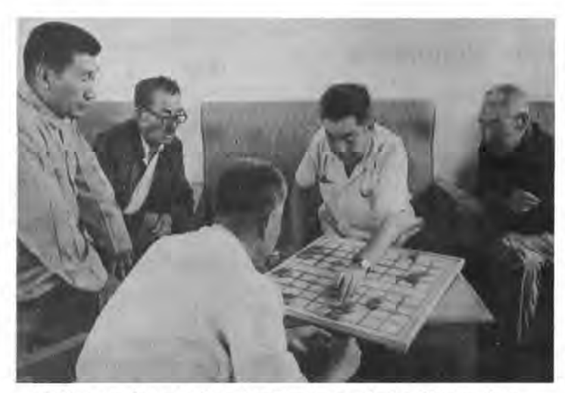
Retirees in Beijing's Tongxian County are playing Chinese chess.

The association sometimes offers its services unsolicited, as it did for the Tianjin Seamless Steel Tube Mill. The mill had accumulated a huge quantity of toxic sodium cyanide residue from its operations, but had found no good way to dispose of it. The waste was kept under guard in a locked warehouse, but this was obviously not a permanent solution.