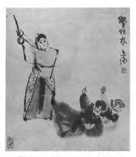
"Wild Boar Woods," adapted from an episode of the classic Chinese novel "Outlaws of the Marshes."