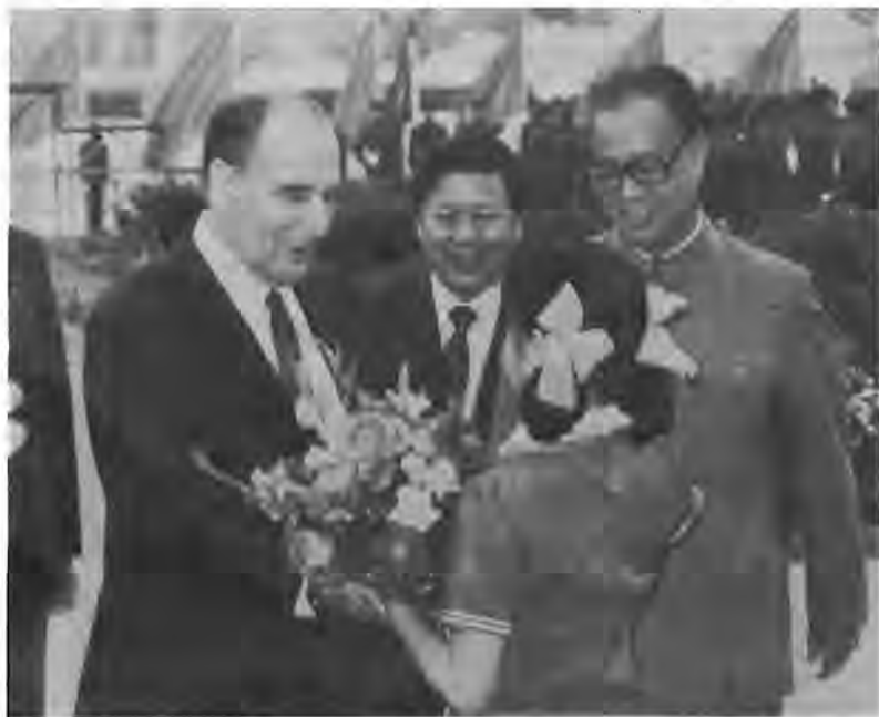
Premier Zhao welcomes President Mitterrand.

"China has no personal interests in Kampuchea. We sincerely hope that Kampuchea will become an independent, peaceful, neutral, and non-aligned country."