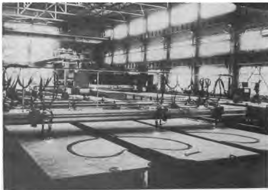
Digital-controlled cutting machines manufactured by the Dalian Shipyard.

— The shipyards will install equipment of world famous brands produced in China under licence, products provided by shipowners or products of other countries.