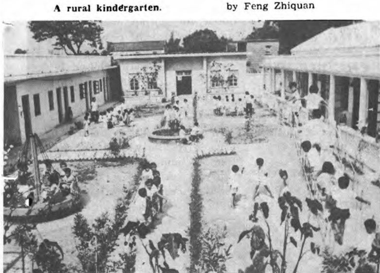
A rural kindergarten.