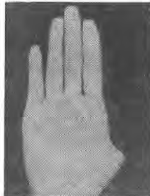
Left: The hand before operation. Right: After the transplant.