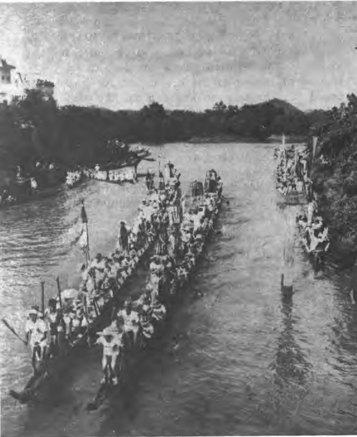
Dragon boat race.