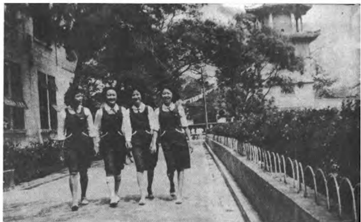
On a campus path.