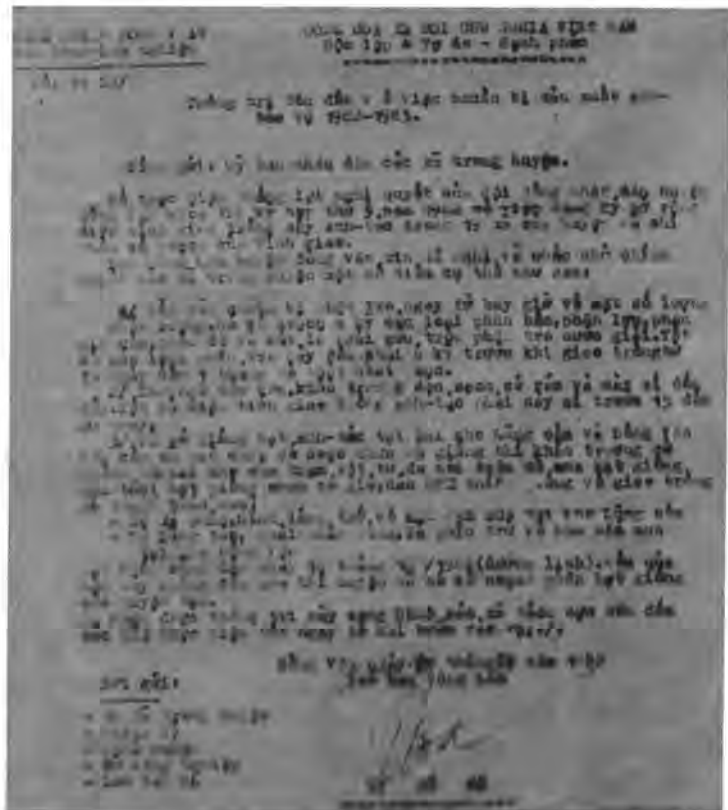
Vietnamese document urging the cultivation of opium poppy.

With such official mobilization, some districts in Hoang Lien Son Province have stipulated that every peasant in the poppy-growing area must sell half a kilogramme of opium to the state each year. A regulation in some districts in Ha Tuyen Province requires those who receive one kilogramme of poppy seed from the government to repay the state one kilogramme of opium, while the extra opium will belong to the grower. In some districts, the government purchased