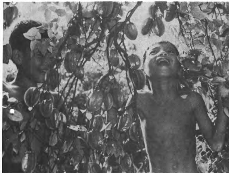
Really want to have a bite!