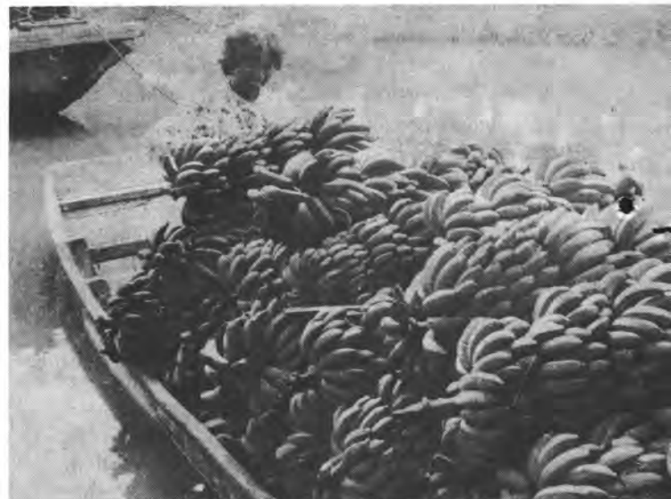
A banana harvest.