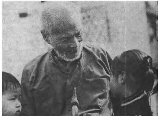
Loving care of a 100-year-old.