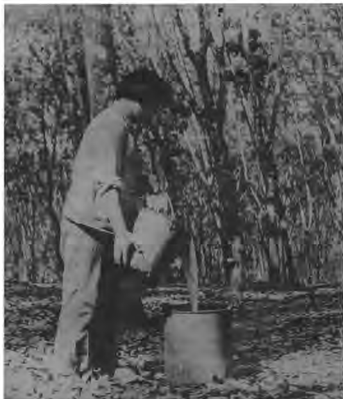
A rubber plantation in Jinghong County, Yunnan Province.

Thus in 1980 when Hainan Island's rubber plantations were hit by the worse typhoon ever, under the protection of the shelter-forest, only 7 per cent of the rubber trees were lost. The researchers then sought to increase the trees'