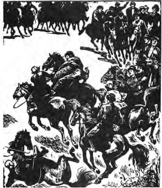
Picking up a Sheep From a Racing Horse. (One of the favourite sports of the minority peoples in Xinjiang.)