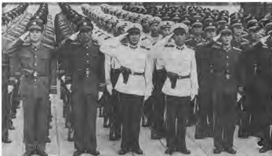
The honour guards of the PLA army, navy and air force and the military band began wearing new uniforms August 1.

He said that China is a socialist country that will never in-