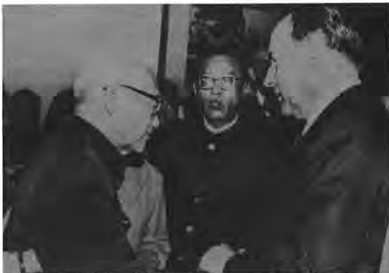
French President Francois Mitterrand conferred the title commander of Legion of Honour on Ba Jin (left front) on May 7 in Shanghai.

The China PEN Centre also has formed a translation committee to supervise the translation into Chinese of literature from other countries. The Beijing magazine, Foreign Literature , already has published two special issues, one