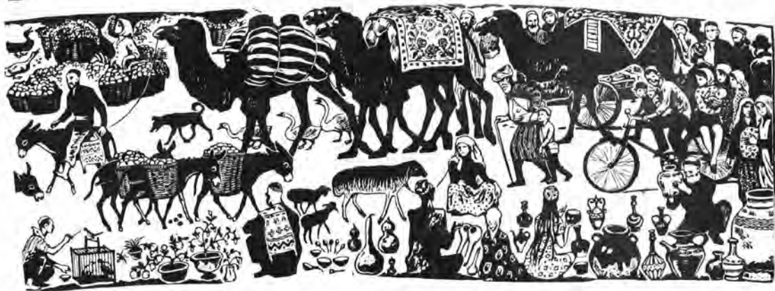
An Ancient Business Centre in Xinjiang. (A long scroll.)