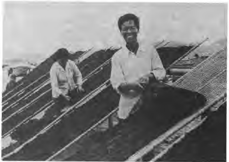
Another bumper harvest of laver.