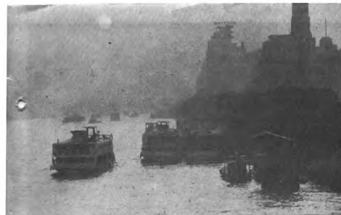
Setting sun in Zhuhai.