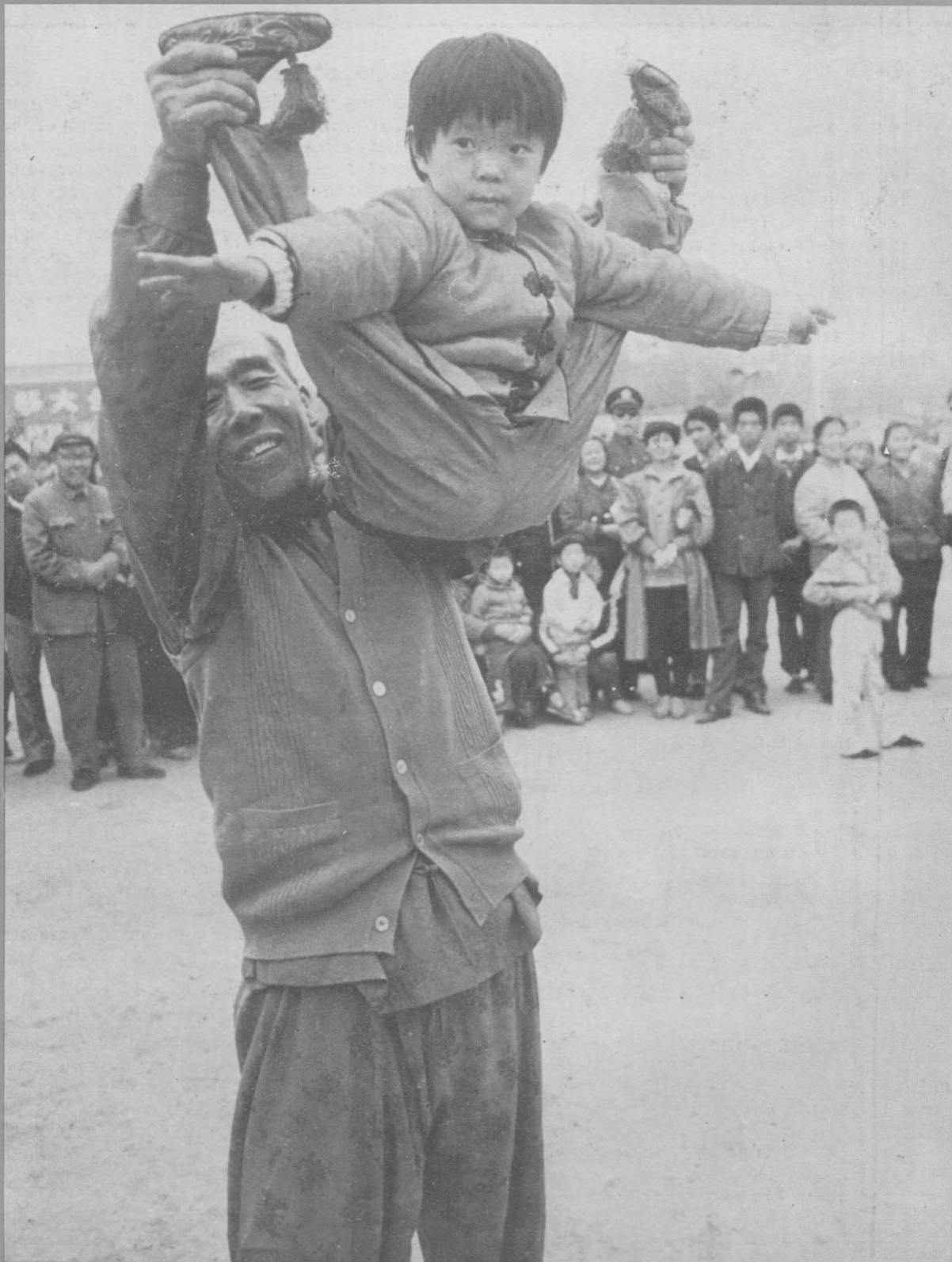
Granddad and grandson.