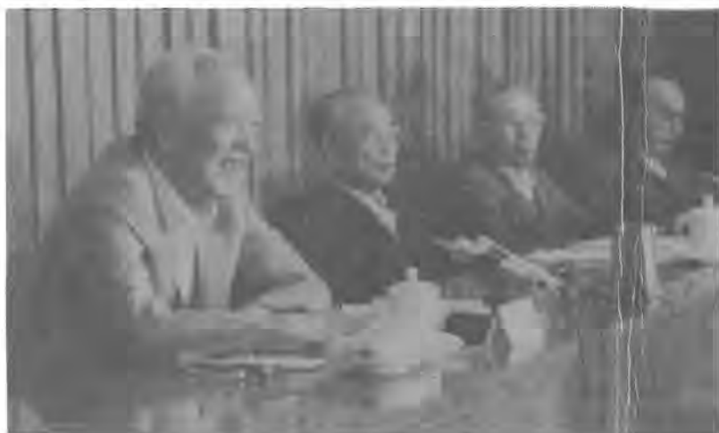
Wan Li, chairman of the NPC Standing Committee, speaking at the opening session.

The eight-day-long meeting, which began on June 29 in Beijing, was presided over by Wan Li, chairman of the NPC Standing Committee.