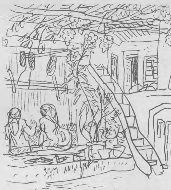
A Family Carpet-Weaving Business.