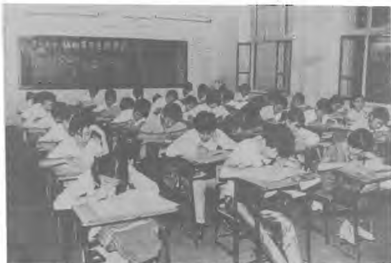
First grade students (junior) of No. 7 Middle School take their final examination.

Each week on Monday there is a flag-raising ceremony at No.7 Middle School.