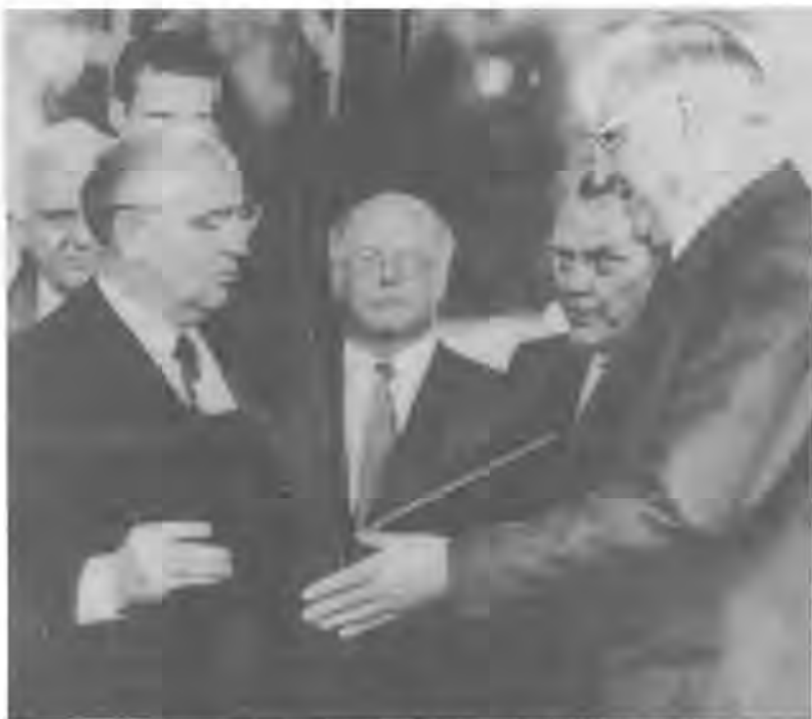
After signing the joint declaration, Mikhail Gorbachev and Helmut Kohl exchange copies.

3. Stressing the bilateral economic and technological relationship. The Soviet Union and East European countries used to be markets for Federal Germany's products. From 1970 to 1984, the volume of trade between Federal Germany and the Soviet Union and East European countries kept increasing, far ahead that of other Western countries. Trade between it and the Soviet Union increased from 2.8 billion marks in 1970 to 18.8 billion marks in 1986, a five-fold increase during the 16 years. Along with the practice of economic reform, the Soviet Union and the East European countries' interest in devel-