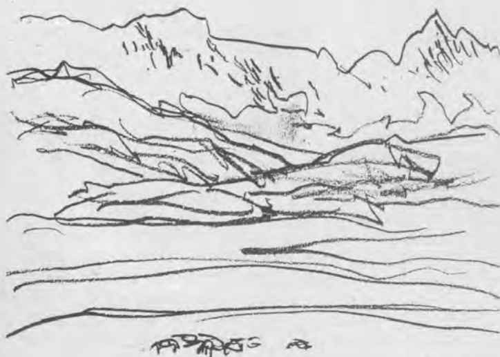
The Pamir Plateau.