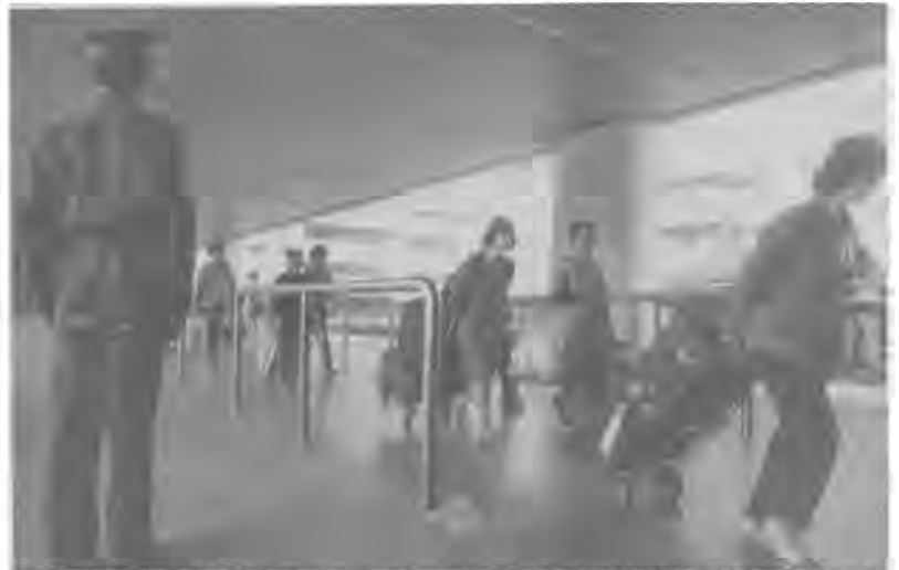
People entering China from Hong Kong pass by the Customs's Station at the Lo Wu Bridge in Shenzhen.

A report from the General Administration of Customs discloses that there were 15 cases in which fake donations of kinescopes were discovered and dealt with last year. The number of kinescopes imported with the approval of various locali-