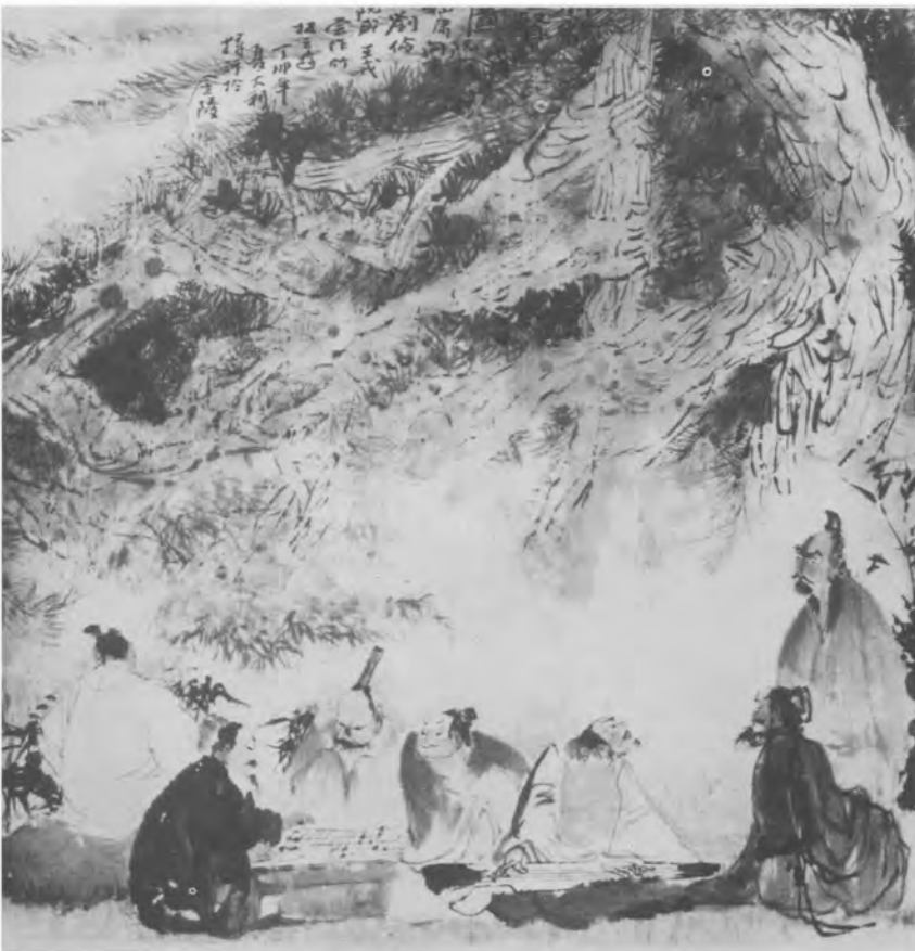
Old Men Playing Chess and Musical Instruments in Ancient Times.