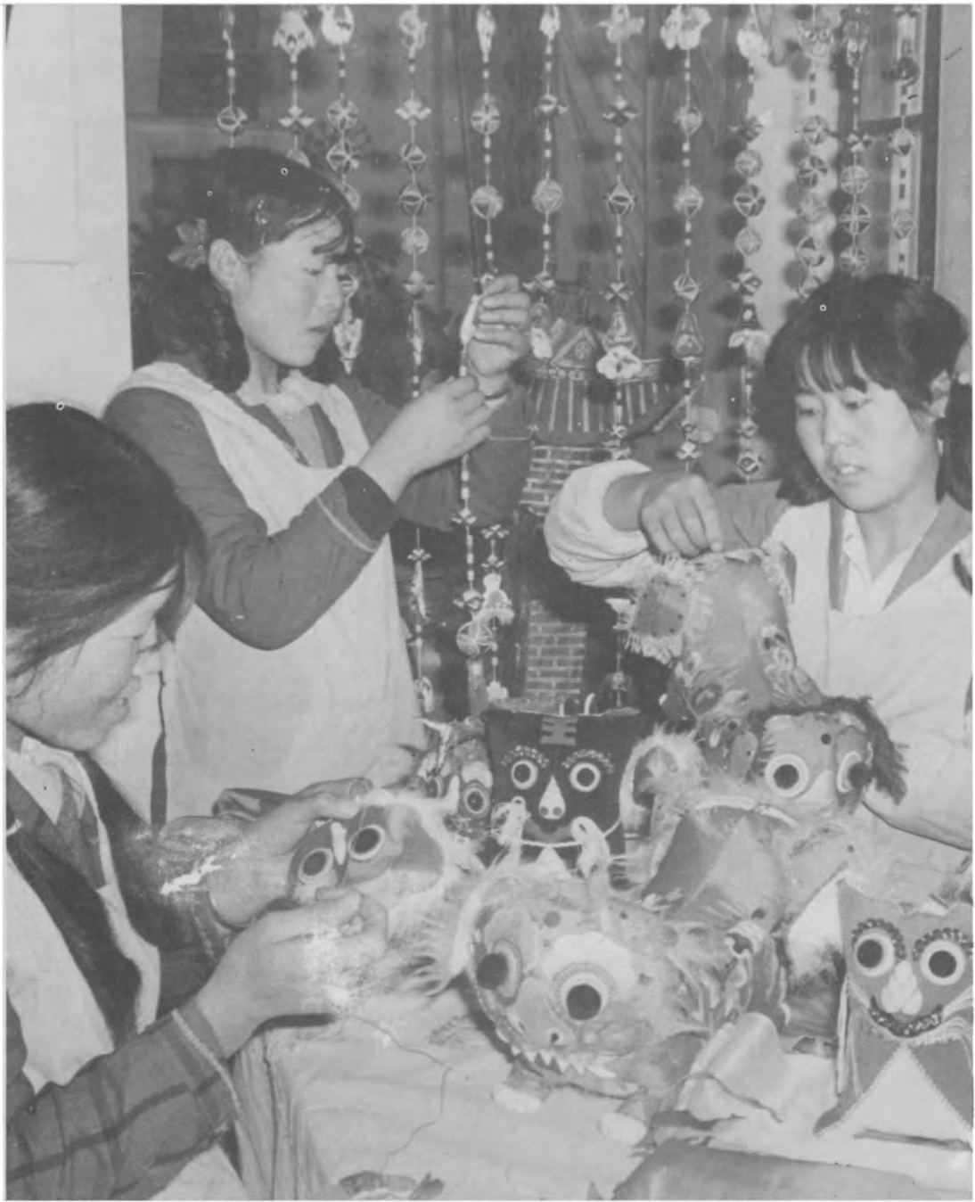
An ancient folk art—cloth toys are very popular with the local people.