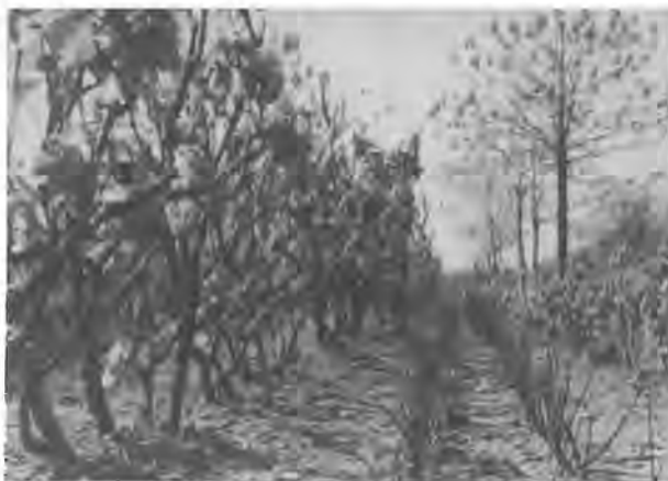
Farmers of Minquan County, Henan Province, reap 860 yuan more from each mu of land by introducing vertical intercropping: fortunes paulownia at the top, grape in the middle, and peanut, wheat and vegetables at the bottom. LU KE

The key to reviving agriculture lies, first of all, in adjusting agricultural policy to suit