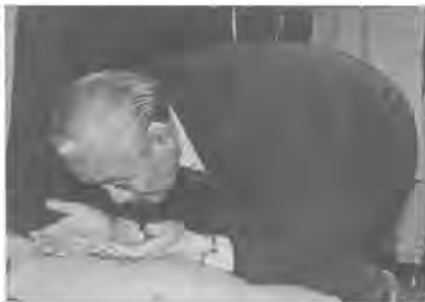
Zhao Puchu, president of the Buddhist Association of China, at a Buddhist service.

the China Buddhists' Association and his predecessors have always advocated the concept of "religion on earth," holding that Buddhist doctrine should be combined with the present reality and Buddhist believers should work for the good of human society. These ideas have been highly acclaimed in Buddhist circles. Chinese Christians, adhering to their creed of "glorifying the God and benefiting mankind," have tried their best to serve society. All this shows that some of the religious doctrines are in tune with the needs of society.