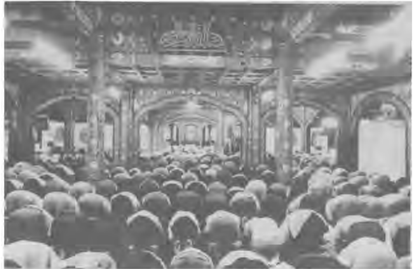
Beijing Moslems at a regular service in the Niujie Mosque.

Q: The Chinese government stipulates that religious organizations and individuals are not allowed to conduct religious