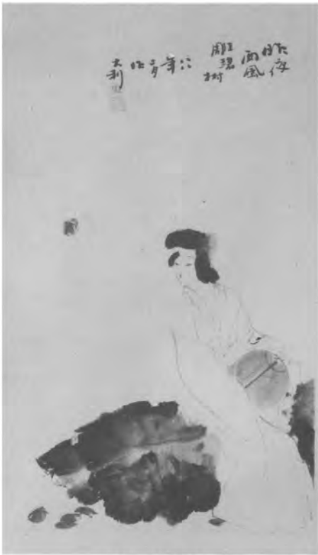
A Beautiful Woman.