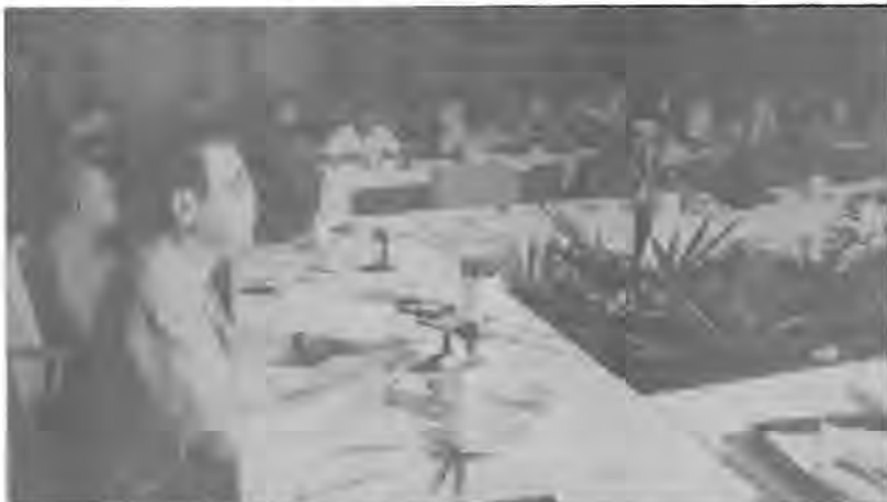
Li speaks at the State Council meeting August 15.