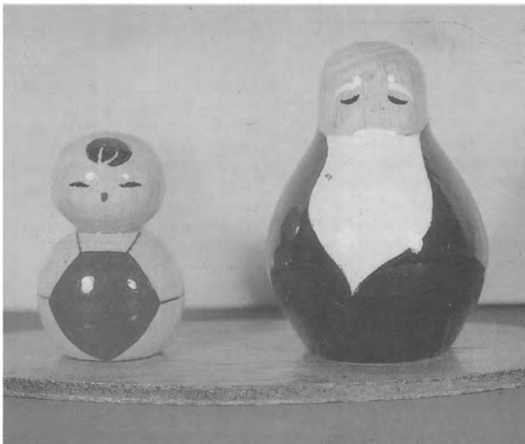
Grandpa and Grandson.