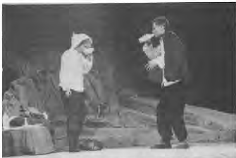
Staged Act of Suicide Shows the Remnants of China's Feudal Morality