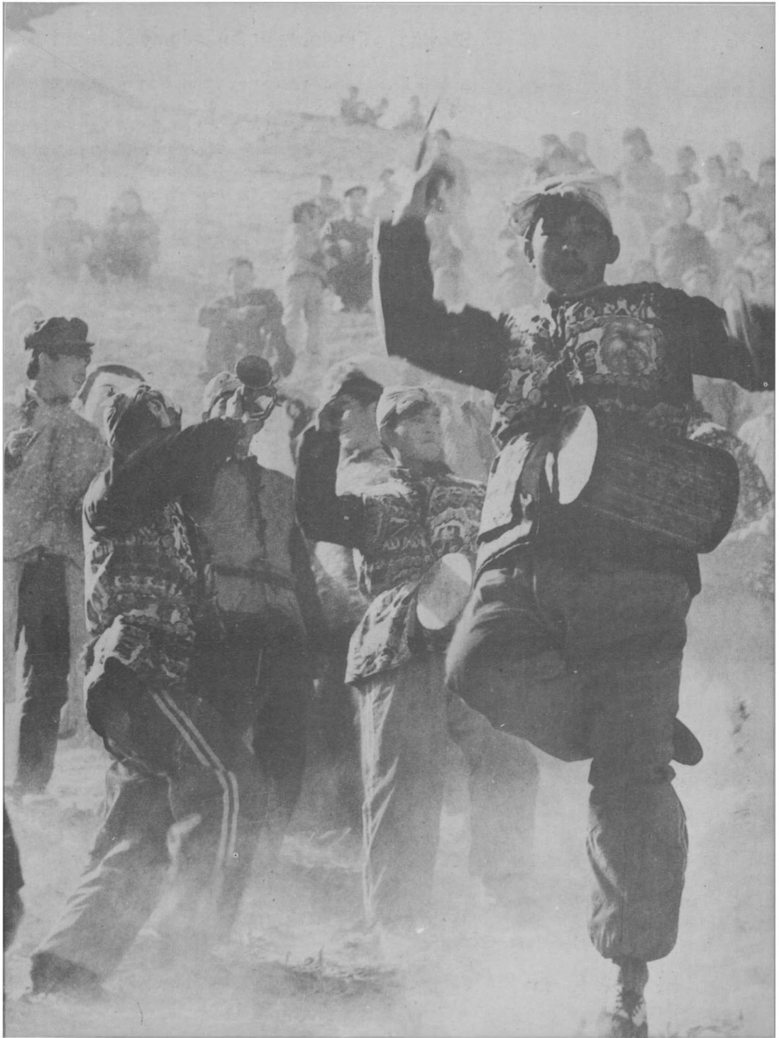
Farmers beating waist drums to celebrate a good harvest.