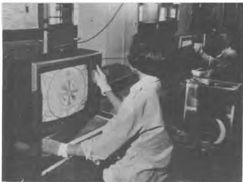
Colour TV production line in a workshop of the Huaqiang Sanyo Electronic Co. Ltd.

Shenzhen Daya Bay Nuclear Power Plant with a capacity of 1.8 million kw (involving investment from the state, Guangdong Province, the SEZ and foreign investors), are large, technologically advanced projects.