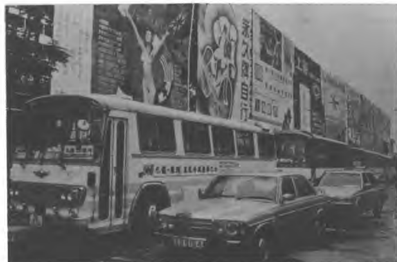
Bus and taxi services provided by the Rongli Transport Company.

● In the field of marketing, Shenzhen's capacity to develop markets is lacking. Most joint ventures, co-operative enterprises and wholly foreign-funded enterprises in Shenzhen rely on foreign partners to import equipment, raw and semi-finished ma-