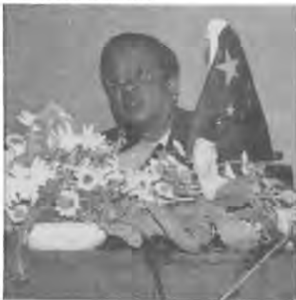
Chinese Foreign Minister Qian Qichen at his press conference in Harare, capital of Zimbabwe.

1. Today the southern African countries and people, who face more encouraging prospects