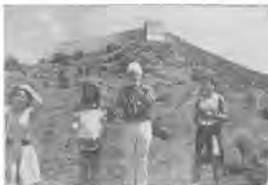
Tourists at the foot of the Great Wall.

Tourists can also sample vast regional flavours in "Beautiful China's" food street. Here you can nibble sweet and sour Cantonese or sizzling hot Sichuanese food or choose from a collection of