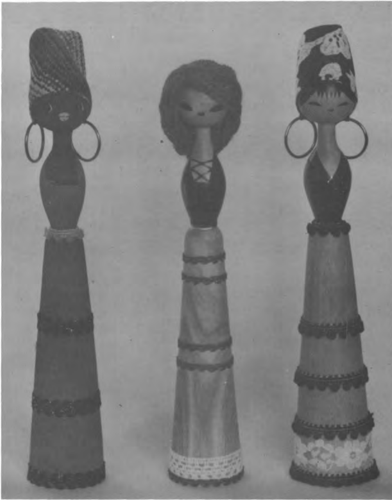
African, European and Asian Dolls.

These wooden toys have been fashioned on a lathe. They show the influence of both traditional Chinese folk toys and Japanese wooden figurines in his work.