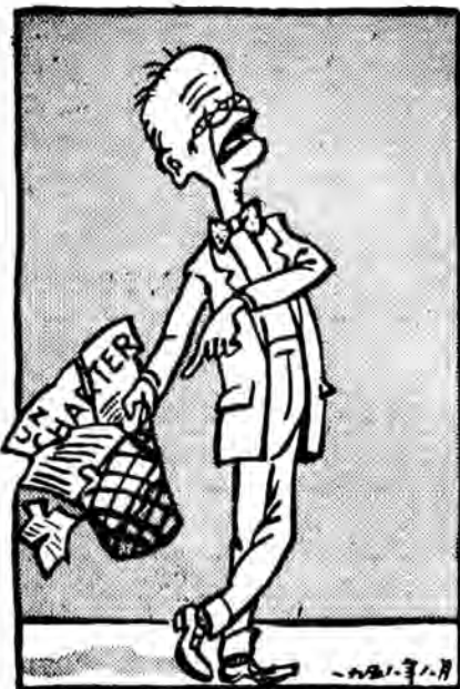
Eisenhower: "I must again emphasize that the United States seeks always to keep within the spirit of the [U.N.] Charter."

Dulles has already fabricated excuses for procrastinating the withdrawal of U.S.-British troops, and has planted hidden rocks in the path of the U.N. Secretary-General to arrangements for the withdrawal of U.S.-British troops. The people of the Arab countries and all peace-loving people throughout the world must not for a moment relax their militancy, but must maintain their high vigilance and persist in the struggle till the day when the U.S.-British invasion troops are completely withdrawn from Lebanon and Jordan.