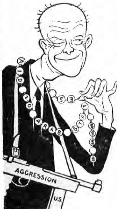
This string of cash is loaded! By Ying Tao

Analysing the war preparations of the Kishi government, a recent article in Jiefangjun Ribao (Liberation Army Daily) calls for increased vigilance against the imperialist aggressive ambitions of the Japanese monopolists.