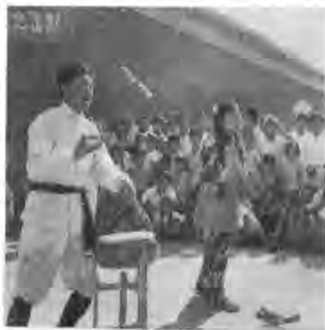
Qu Yi artists perform at Tien An Men Square

The Peking festival was a unique opportunity for qu yi artists from various parts of the country to meet and exchange experience, to improve their art in the service of the people and of socialism. The festival saw excellent performances of the great old standbys of qu yi , but the main interest lay in the