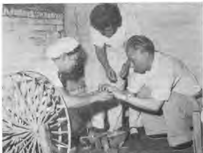
Liu Shao-chi, Chairman of the Standing Committee of the National People's Congress, visits Hungshunli's new type of co-operative in Tientsin

They got together and discussed these problems. Suggestions were put forward to set up a community nursery, canteen, laundry, tailoring group, etc. This seemed like a likely solution, but it called for radical changes, a clean break with routine, and good-bye to the old pattern of each family for itself. They weighed the