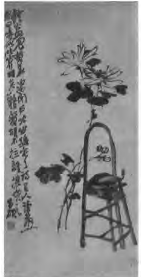
Oil Lamp and Chrysanthemums (64.6 × 32 cm.) By Wu Chang-shih

During this period the Lingnan school of painting, which had assimilated some of the techniques of Japanese painting, flourished in south China. Kao Chien-fu