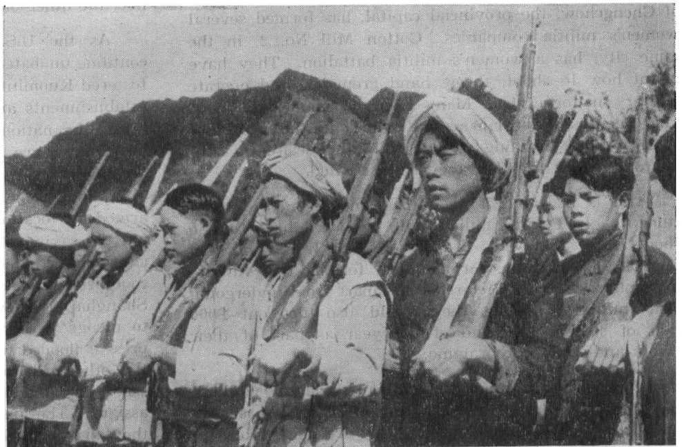
Militiamen of the Yi nationality in Kweichow Province

In the old revolutionary areas the people are giving vent to their pent-up feelings by redoubling their efforts