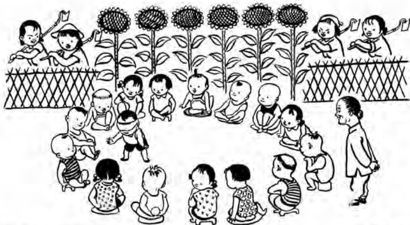
No worries now about baby!

As far as the exploiting class is concerned, we have indeed destroyed a lot. We have put an end to the monopoly of social welfare services by the exploiting class. We also