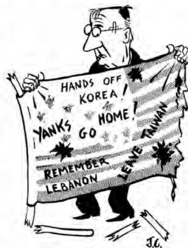
"Old Glory" - new shame

The American foreign affairs specialist and former State Department official, George F. Kennan, declared in a recent speech at Brandeis University, Mass. that "the United States is the most hated nation in the world. I cannot think of an instance in which any great country has drawn upon itself, or has at least become the target of so much obloquy, so much ill-will, so much disapproval and criticism, in some cases, so much outright hatred, as has this one."