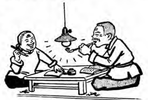
"Granddad, the days of the oil lamp are gone."

Peking's New Airport Building. The new airport building in Peking, the biggest and most modern in China, occupies over 10,000 square metres, complete with dining halls serving Chinese and Western food, hairdressing saloons, a cinema projection room, a branch of the People's Bank, a tourist office, post office, etc. It has an automatic conveyor system to carry luggage from the ground floor and first floor.