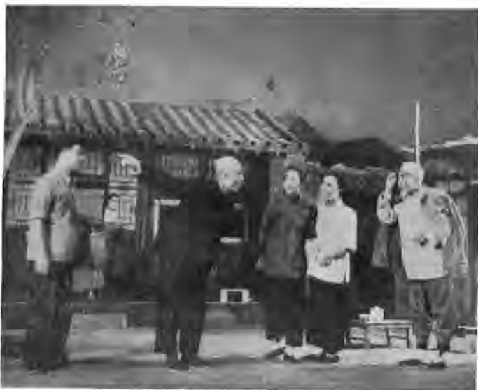
Grandad Keng talks about the rectification campaign