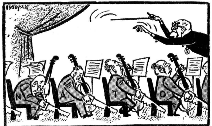
Under Dulles' hand The NATO band Sings U-N-I-T-Y- But — under J.F.'s collarband Strife's in command Sowing discord underhand

states and expansion of their military forces met with opposition. She also ran up against difficulties in getting them to agree to give her more missile bases. Up till now, among the Western countries, only Britain and Italy have agreed to the establishment of U.S. missile bases in their territories. The Western European countries see more clearly that as the situation now stands, the building of such bases in their coun-