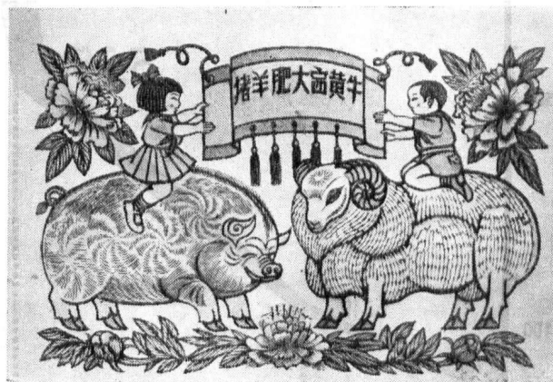
A woodcut in colour designed for the New Year By Huang Yung-yu

In the meantime, the transport drive ( Peking Review , No. 42, p. 4) continues. At a telephone conference jointly sponsored by the Ministries of Railways and Commerce on December 22, a decision was made that all non-staple foods and daily necessities that reached the railway stations before New Year must be shipped to their destinations without delay. Food grains, live pigs, frozen meat and delicious tangerines are being rushed to Wuhan, Shanghai and other cities from Szechuan. Special trains are bringing vegetables, pork and mutton from Heilungkiang Province to Peking and Tientsin.