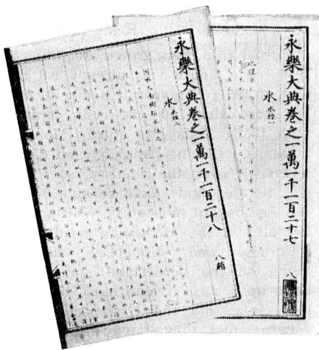
The first two volumes of Shui Ching Chu (Commentary on the Waterways Classic), Volumes III27 and III28 of the Yung Lo Ta Tien

The fifteenth and sixteenth centuries saw a great deal of scholarly research work; the Chinese encyclopaedic movement reached its climax during the reign of the third emperor Yung Lo (1403-1425 A.D.) of the Ming dynasty. More than 2,000 scholars were employed to compile the Yung Lo Ta Tien , a gigantic work of 11,095 volumes in 22,937 parts. The encyclopaedia, which took five years to complete, was compiled from over seven thousand books from