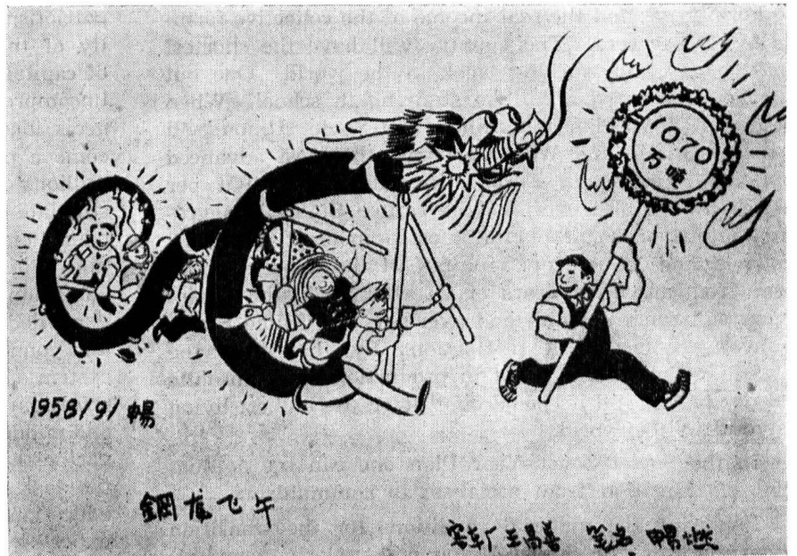
A worker's drawing. "The Dragon Dance for 10.7 Million Tons of Steel" By Wang Chang-shan

When the news of victory was broadcast, the whole nation rejoiced with a sense of personal participation. The news reached the Anshan Iron and Steel Works that night, with the rataplan of drums the clash of cymbals and hiss of fire-crackers. There was dancing and singing. Workers of the first night shift of the No. 2 Steel Mill celebrated by turning out an extra heat of steel. In Peking, 6,000 students and faculty members of the Institute of Iron and Steel held a flying celebration meet-