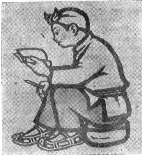
A peasant student Woodcut in colour by Li Ping-fan

The contents of the new textbooks are closely linked with production in Honan, and deal largely with the