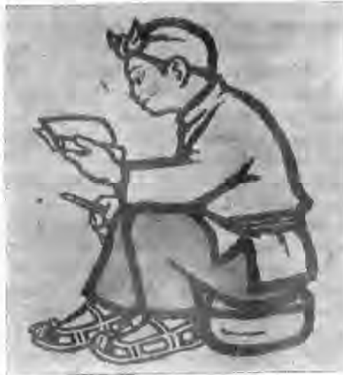
A peasant student Woodcut in colour by Li Ping-jan

The contents of the new textbooks are closely linked with production in Honan, and deal largely with the