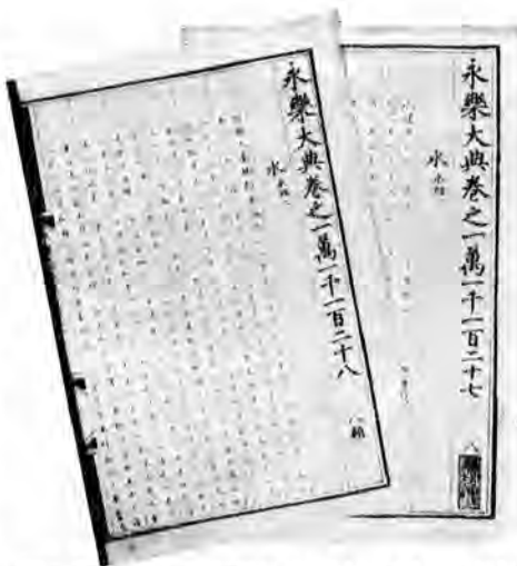
The first two volumes of Shui Ching Chu (Commentary on the Waterways Classic), Volumes III27 and III28 of the Yung Lo Ta Tien

The fifteenth and sixteenth centuries saw a great deal of scholarly research work; the Chinese encyclopaedic movement reached its climax during the reign of the third emperor Yung Lo (1403-1425 A.D.) of the Ming dynasty. More than 2,000 scholars were employed to compile the Yung Lo Ta Tien , a gigantic work of 11,095 volumes in 22,937 parts. The encyclopaedia, which took five years to complete, was compiled from over seven thousand books from