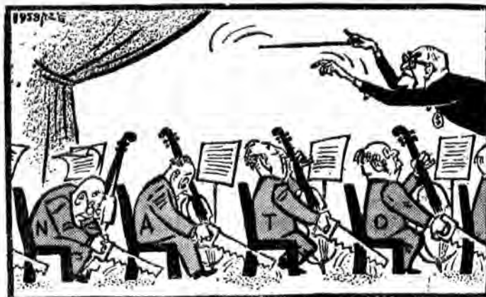
Under Dulles' hand The NATO band Sings U-N-I-T-Y- But—under J.F.'s collarband Strife's in command Sowing discord underhand

states and expansion of their military forces met with opposition. She also ran up against difficulties in getting them to agree to give her more missile bases. Up till now, among the Western countries, only Britain and Italy have agreed to the establishment of U.S. missile bases in their territories. The Western European countries see more clearly that as the situation now stands, the building of such bases in their coun-