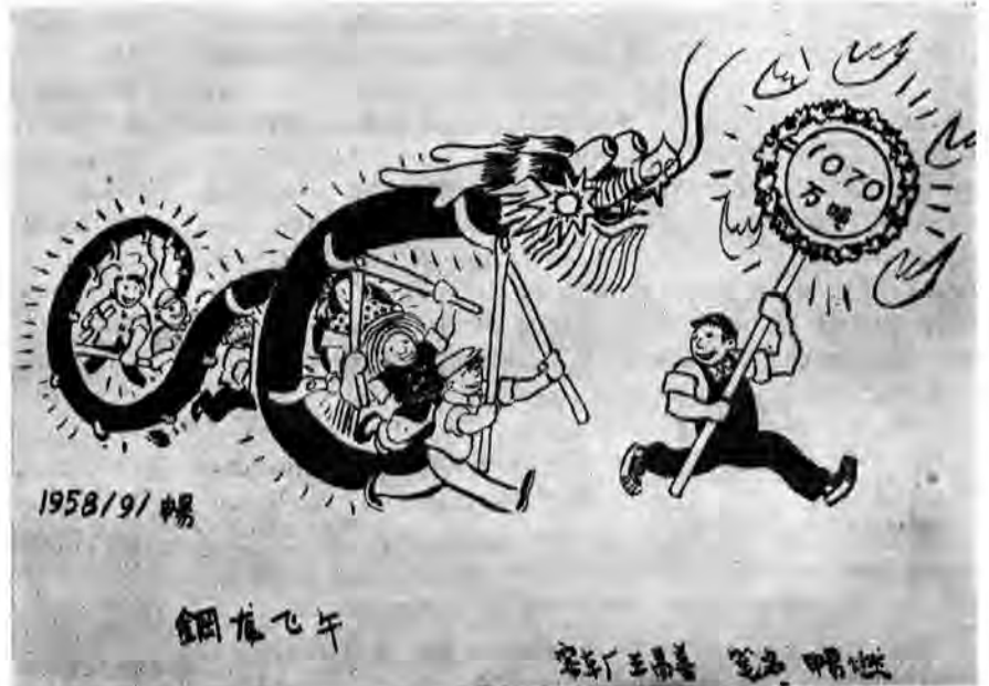
A worker's drawing. "The Dragon Dance for 10.7 Million Tons of Steel" By Wang Chang-shan

When the news of victory was broadcast, the whole nation rejoiced with a sense of personal participation. The news reached the Anshan Iron and Steel Works that night, with the rataplan of drums the clash of cymbals and hiss of fire-crackers. There was dancing and singing. Workers of the first night shift of the No. 2 Steel Mill celebrated by turning out an extra heat of steel. In Peking, 6,000 students and faculty members of the Institute of Iron and Steel held a flying celebration meet-