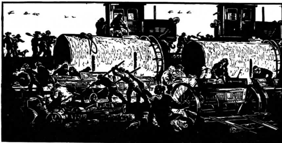
A Tractor Repair Station

One hundred and seventy thousand new college graduates are fanning