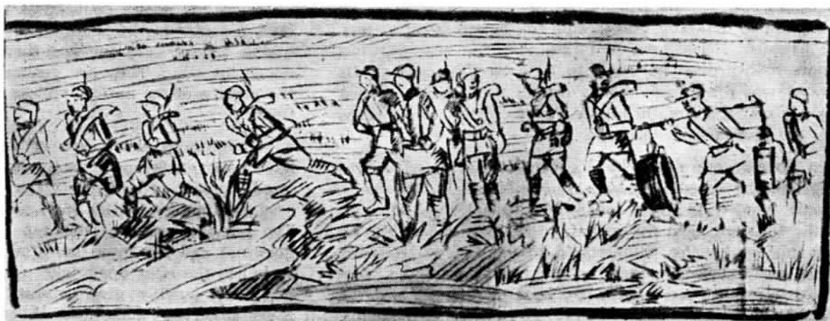
Marching Across the Grasslands