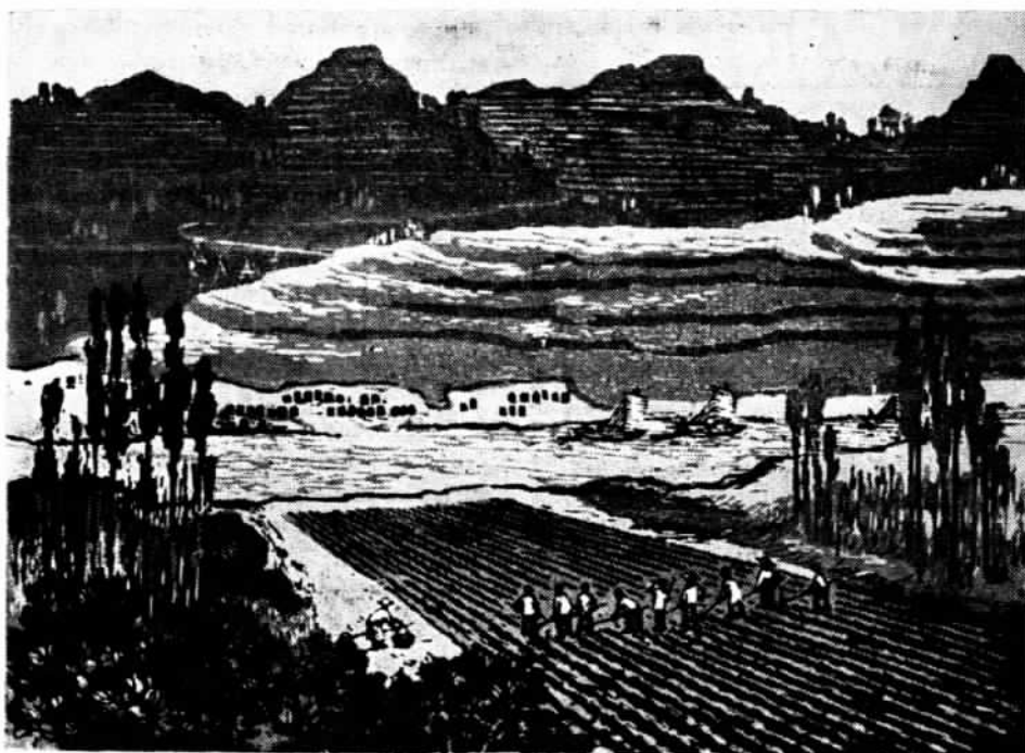
Farms on the Loess Land

There were some hardly contested discussions regarding the schedule of work in building this reservoir. Some wanted to stick to the traditional method: first build the dam, then the irrigation channels and finally do the land contouring. Others held different views. Arguing from past experience, they recalled that when things were tackled in that order both the land contouring and the cutting of channels lagged behind the progress of the dams. Then the water sometimes lay stored in the new reservoirs