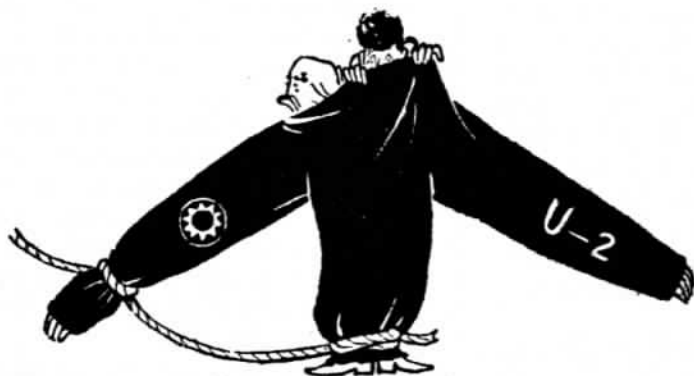
Cartoon by Ying Tao

The Chinese Government statement declares: "So long as U.S. imperialism persists in its policies of aggression and war, so long as the United States still occupies China's territory of Taiwan, China's security cannot be ensured, nor can the tension in the Far East and the world be eliminated. For the sake of China's security and Far Eastern and world peace, the armed forces of the United States must be withdrawn from Taiwan; they must be withdrawn from Japan, southern Korea, southern Viet Nam, Laos, Thailand and the Philippines; they must be withdrawn from all U.S. military bases on foreign soil." This gives expression to the firm, unshakable will of the 650 million people of China. The Chinese people will work in concert with the people of all other countries who cherish peace, to smash the U.S. imperialist plans for aggression and war and safeguard national independence and world peace. When the people throughout the world are united even more closely, the policies of aggression and war of U.S. imperialism will inevitably be defeated; and they certainly can be defeated.