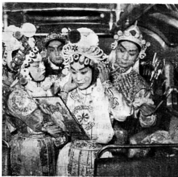
Chinese actors and actresses in Helsinki — working to a tight schedule, they often had to make-up en route on the bus

We also gave several separate special programmes for our friends from other Asian countries, from Africa and from Latin America. These always included items from the countries of our guests: songs, dances or instrumental pieces. And invariably these received standing ovations. When our orchestra played the Guinean melody The Elephant , or Ghanaian tune Happy Life , and our