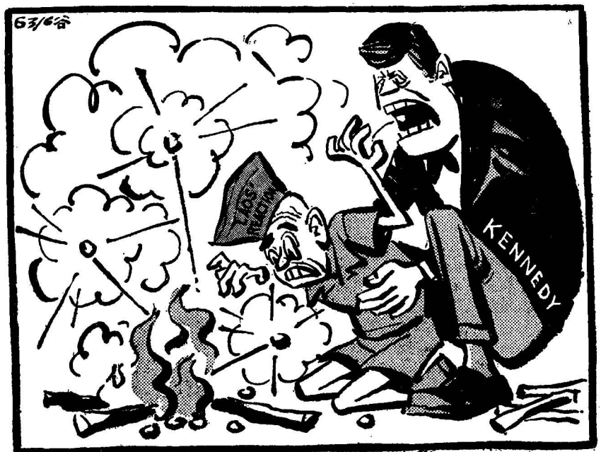
Pulling His Chestnuts Out of the Fire

The Laotian people are entirely able to settle their internal questions by themselves. The most urgent internal question of Laos at present is to defend the National Union Government and restore and strengthen national unity. It is our belief that so long as Premier Phouma strictly follows the principle of tripartite unanimity, it will be possible to get rid of foreign intervention, settle step by step the internal disputes through tripartite con-