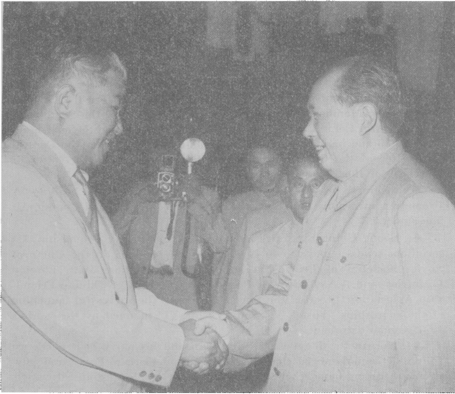
Chairman Mao Tse-tung greets President Choi Yong Kun

"Your visit," said Chairman Liu Shao-chi to his Korean guests at the Peking airport upon their departure for the northeast on June 17, "has not only made closer the already very close friendship between the Chinese and Korean Parties, the two Governments and the two peoples, but made positive contributions to upholding and strengthening the unity of the socialist camp and the international communist movement."