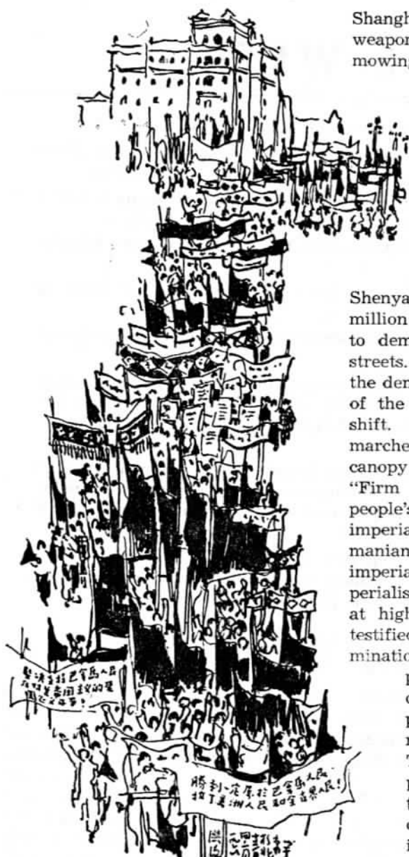
Mass demonstration in Peking

firm support of Shanghai's working class for the Panamanian people. Said she: "United in their struggle and with the support of the world's people, the Panamanian people will surely defeat all U.S. schemes and brutal acts of aggression and regain sovereignty over the canal zone."