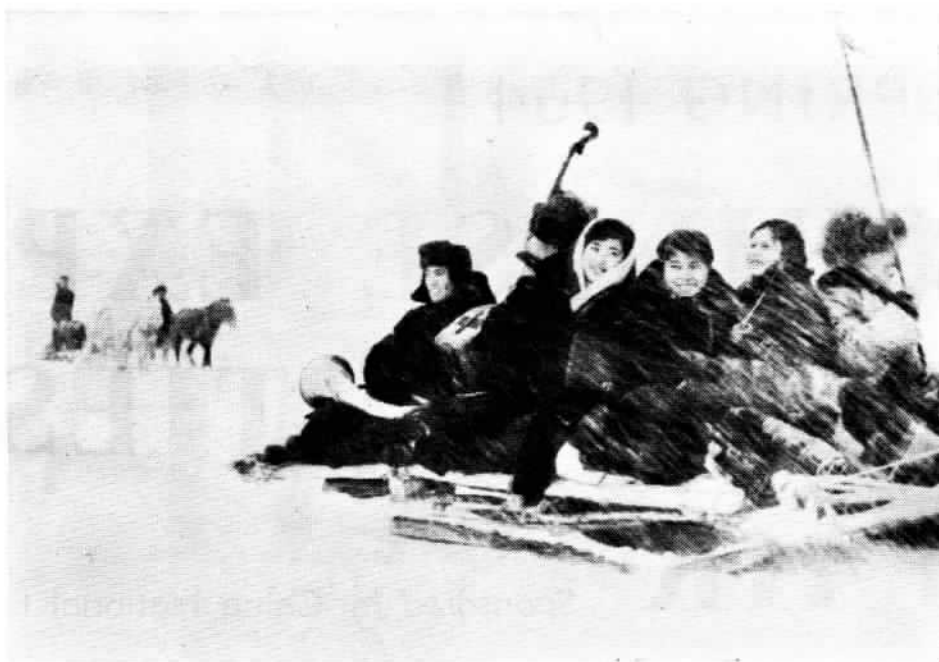
To make music in a snowbound village