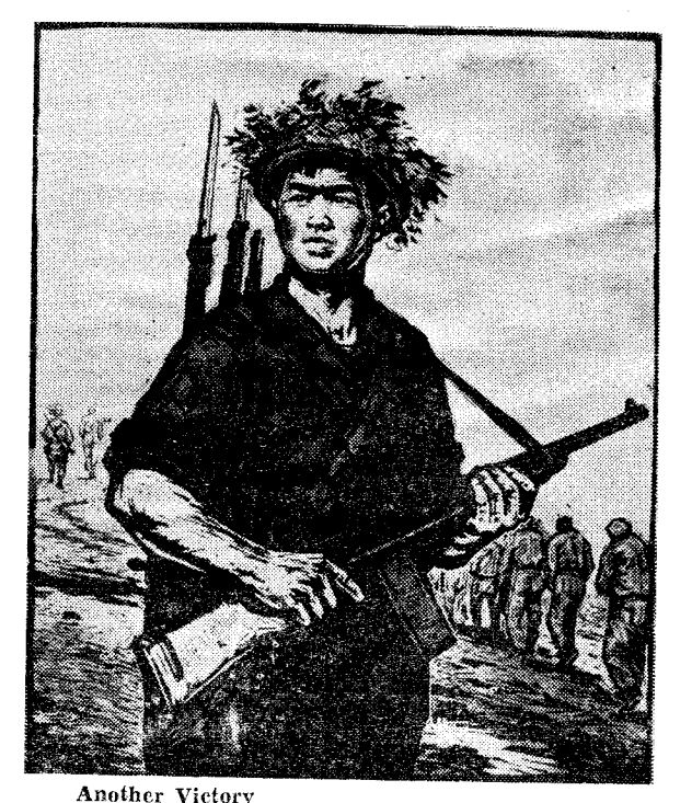
Woodcut in colour by Wu Chiang-nien

Letters From the South as produced by the P.L.A. modern drama troupe in Peking takes Chinese audiences into