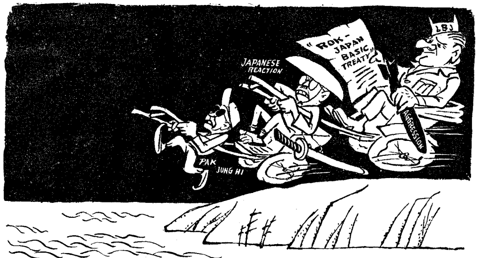
Rickshaw Boys and Their Master

The Chinese Government and people have all along supported the just struggles of the Korean and Japanese peoples and strongly condemn the criminal activities of U.S. imperialism in promoting the sinister collaboration of the Japanese reactionaries and the Pak Jung Hi clique. The signing of the "ROK-Japan Basic Treaty" and the related "agreements" is a grave provocation not only against the Korean and Japanese peoples, but also against the Chinese people and the peoples of other Asian countries. The Chinese Government will never recognize the so-called "ROK-Japan Basic Treaty" signed by the Japanese Government and the Pak Jung Hi clique. The 650 million Chinese people will stand unwaveringly with the Korean and Japanese peoples as well as with the peoples of other Asian countries in carrying to the end their struggle against the U.S. imperialist scheme for using the reactionaries of Japan and the Pak Jung Hi clique to expand its aggression.