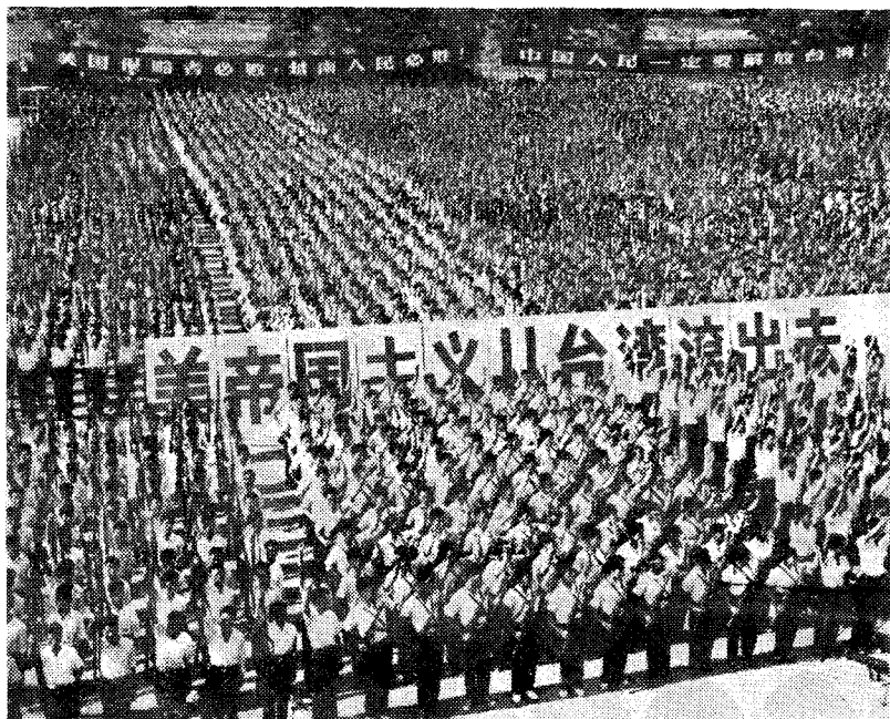
10,000 people's militia at the Peking Shooting Range shout the slogan: "U.S. Imperialism, Get Out of Taiwan"

In Shanghai , 30,000 militia members, including former volunteers in the Korean war, veterans of the resistance war against Japan and the war of liberation against the Chiang Kai-shek reactionaries, militiamen and women composed of advanced workers, school teachers and students, shop clerks and government employees met at the People's Square, the former "Race Course" where before liberation British and American troops used to march