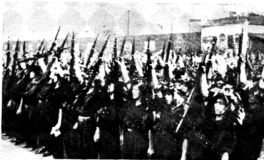
Foochow's militia at a meeting opposing U.S. occupation of Taiwan

More than 5,000 militia members of the Tibetan and Han nationalities poured into the streets of Lhasa in a great demonstration. Many of them were former slaves and serfs who distinguished themselves in putting down the rebellion of the reactionary serf-owners in Tibet. A militia platoon leader whose parents and sisters were killed by serf-owners said that he would still further improve his military skill and contribute his share to the liberation of Taiwan.