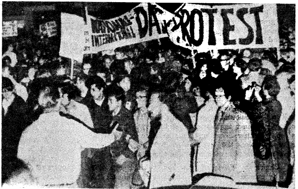
In Berkeley, California: At the start of the National Days of Protest against war in Viet Nam

Beat-the-Draft Campaign. In many cities, the recruiting centres of the three armed services were the destination of the demonstrators. In New York City, several hundred youth demonstrated before the biggest recruiting station there, where a draft-age young man publicly burnt his draft-card. Aware that this had been made a federal offence under recent legislation by the Johnson Administration, this courageous youth said: "I hope this will be a significant political act." The government's calling up of young people through the draft to fight and die in a war without glory has become especially unpopular and the Johnson Administration has been so short of manpower in this unpopular war that it has not only recruited newly wed young