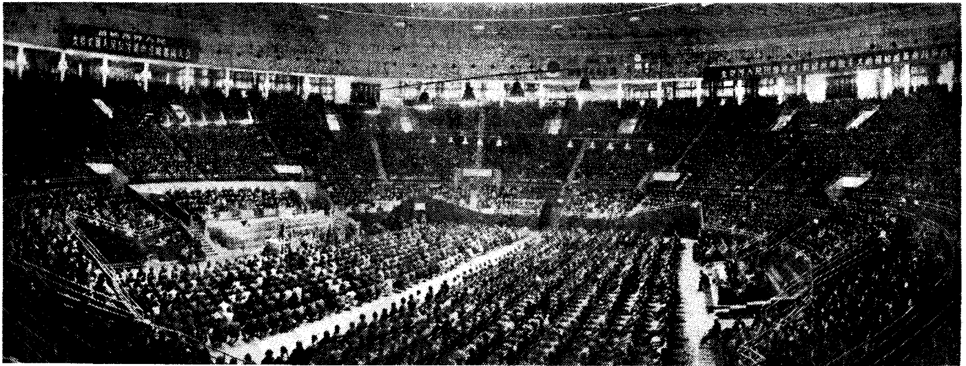
A view of the packed Workers' Gymnasium during the rally

Liao Cheng-chih, Vice-Chairman of the China Peace Committee, in his speech affirmed the Chinese people's backing for the American people in their fight against imperialism in their own country. Their present struggle, he said, demonstrated that on the Vietnam question the American people stood on the side of the Vietnamese people and not on the side of the U.S. Government. This was a heavy blow to U.S. imperialism and a powerful support and an encouragement to the anti-U.S. imperialist struggle of the Vietnamese and other peoples of the world.