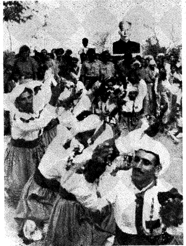
A dance performance to welcome Chairman Liu

At Islamabad on the evening of March 27, Chairman and Madame Liu Shao-chi gave a banquet in honour of President and Madame Ayub Khan. Proposing a toast, Chairman Liu once again expressed his thanks to the President and to the Pakistan Government and people for their hearty reception. He said: "We have held talks with His Excellency President Ayub Khan. The talks have been harmonious and successful. The friendly relations and co-operation between our two countries have been satisfactory. There is every favourable condition for the further development of these relations. On the one hand, in the fields of national construction and foreign policy, we require of each other nothing particular other than unity against aggression; on the other hand, we have no intention whatsoever to do you harm, nor do you, we believe, have any intention to do us harm. The basic policy of both sides is a policy of equality, mutual benefit, and non-interference in each other's internal affairs. Therefore, there is no reason why our friendly