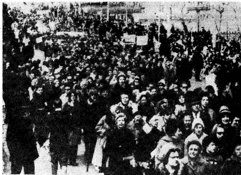
Some of the 100,000 New Yorkers who demonstrated on Fifth Avenue

Similar protest actions were held in Washington, San Francisco, Hono-