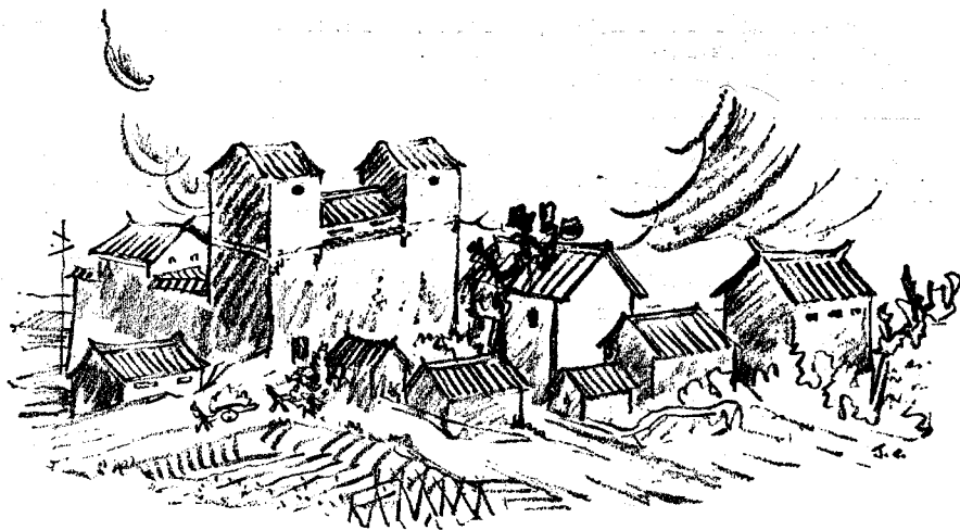
A corner of Yangtan village

Tickets to a film show put on by the county's mobile projection team and opera performances by touring professional troupes cost 0.1 or 0.2 yuan respectively, we learnt. Amateur shows are free.