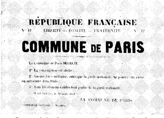
Decree of the Commune on the National Guard

people are not yet complete, or when they themselves are under attack by the revolutionary forces, they frequently resort to a "peace" intrigue to deceive the people. Once they think themselves strong enough to defeat the revolutionary people, they raise their butcher's knife and start a bloody slaughter. These were exactly the dual tactics Thiers used against the Paris Commune.