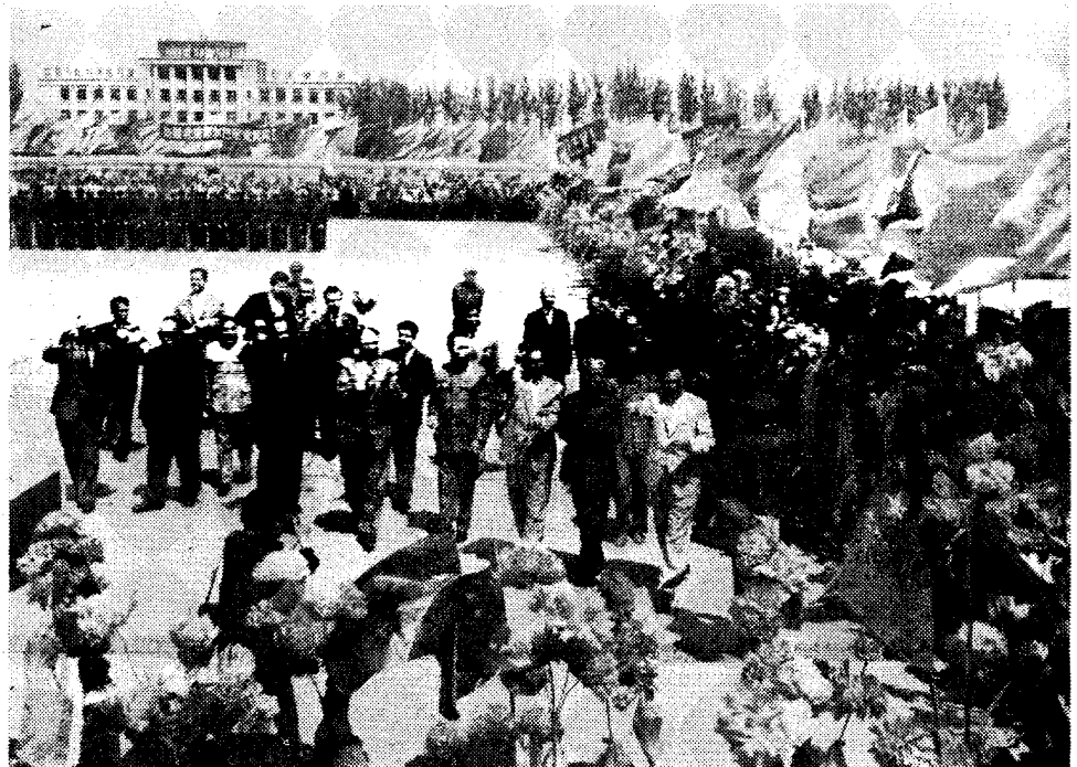
Albanian guests respond to welcome at Peking Airport