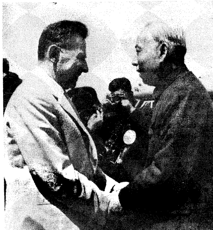
Chairman Liu Shao-chi greets Chairman Mehmet Shehu

As Comrade Shehu walked past the cheering crowds in the company of Comrades Liu Shao-chi and Chou En-lai, the people waved streamers and miniature national flags of the two countries and beat drums and cymbals to greet the Albanian comrades. They shouted: "Long live the militant friendship between the great peoples of China and Albania!" "Firmly oppose U.S. imperialism — the No. 1 enemy of the people throughout the world!" "Firmly and thoroughly oppose modern revisionism!" and "Long live invincible Marxism-Leninism!"