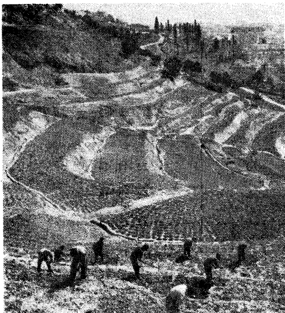
In making these terraced fields the farmers of Berat, in Albania's mid-south highlands, used the experience of China's Tachai production brigade

Meanwhile, in artistic and literary circles, more than 40 noted writers and artists have gone out to work among the masses, helping the workers and peasants in their cultural activities and, at the same time, drawing inspiration from the life of the masses for creative work. Theatrical companies, touring the countryside, help the peasants' amateur art troupes. More doctors and medical workers are going to the countryside in this nationwide campaign to support agriculture. Such is the scene as Albania's socialist revolution and construction surges to a new high.