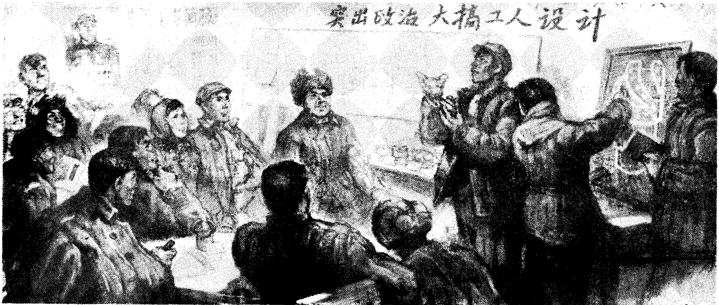
Taching workers discussing a technical problem