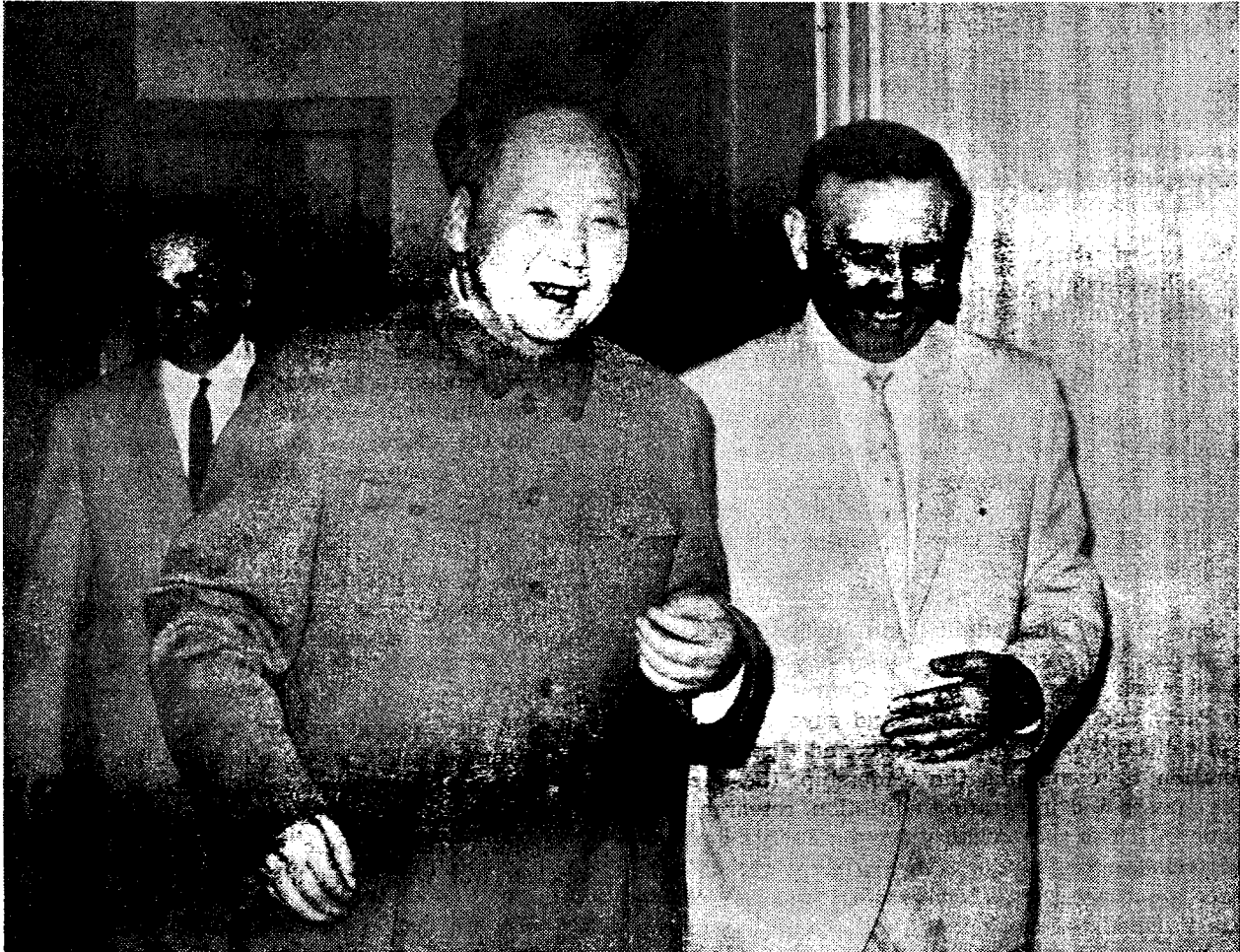
Comrade Mao Tse-tung meets Comrades Mehmet Shehu (right) and Hysni Kapo (left)

Comrades Mao Tse-tung, Chou En-lai, Lin Piao, Teng Hsiao-ping and Wu Hsiu-chuan held talks with Comrades Mehmet Shehu, Hysni Kapo, Abdyl Kellezi and Nesti Nase. Both sides were completely at one on all questions discussed.