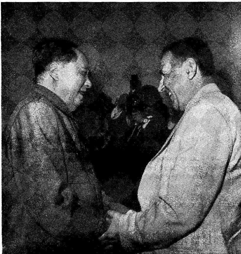
Comrade Mao Tse-tung warmly shakes hands with Comrade Mehmet Shehu

Chinese Party and state leaders held several talks with the Albanian comrades. A joint statement was signed, which was described by Chairman Shehu as an