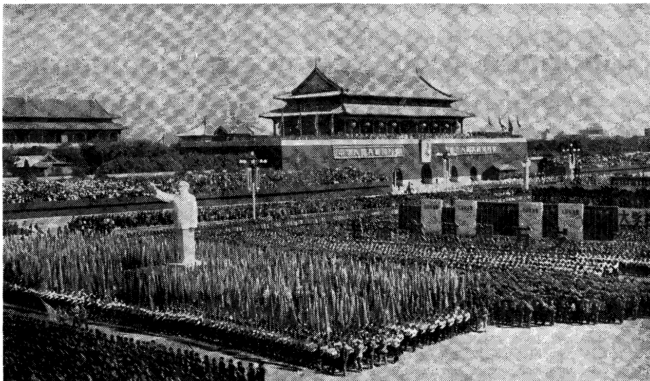
The advance guard at the head of the parade marches past Tien An Men Square with a huge statue of Chairman Mao in military uniform

Some 3,000 representatives of the workers, peasants and soldiers and of the national minorities and the Red Guards who came from all corners of the country went up in groups to the Tien An Men rostrum to stand beside Chairman Mao and participate in the festivities. They have each in their own field performed heroic feats and they were jubilant to be at the side of Chairman Mao. These heroes and heroines and the Red Guards excitedly said: By receiving us on the Tien An Men rostrum Chairman Mao is showing us the greatest