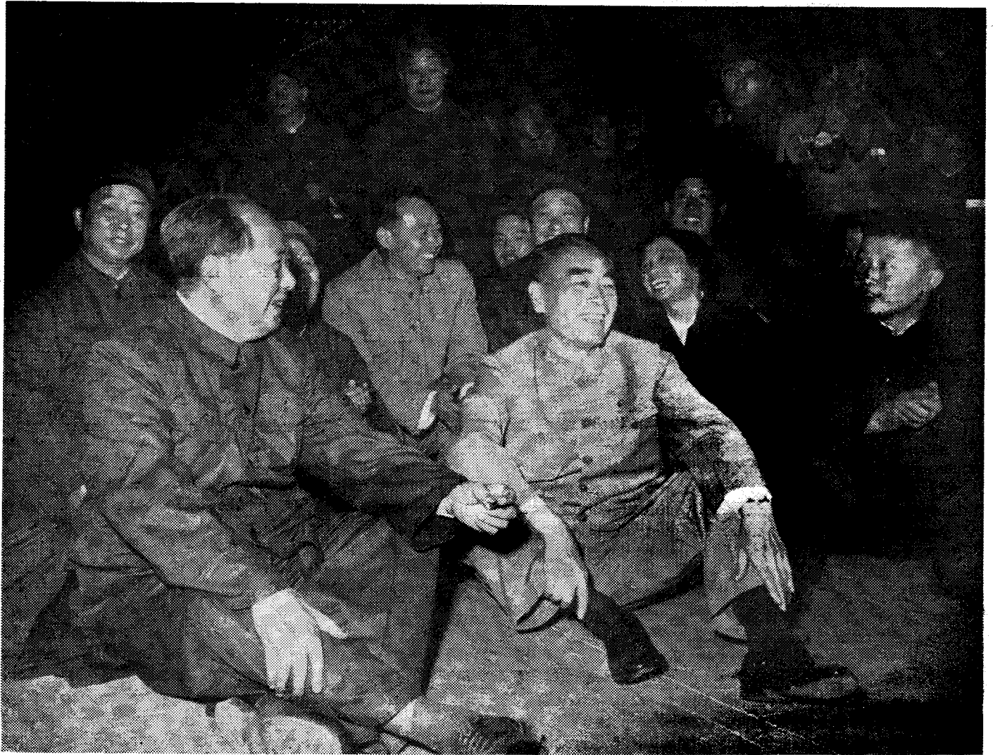
Our respected and beloved leader Chairman Mao and Comrade Chou En-lai sit on Chinshui Bridge in front of the Tien An Men Gate to watch the festival fireworks together with the masses on the night of National Day

solicitude and encouragement. We must see that Mao Tse-tung's thought take still firmer root in us. We must always work for the revolution and remain loyal from generation to generation.