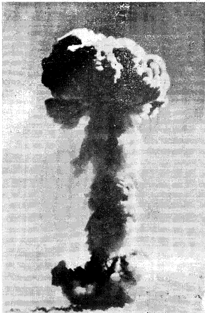
China's first nuclear explosion, 15:00 hrs., Oct. 16, 1964