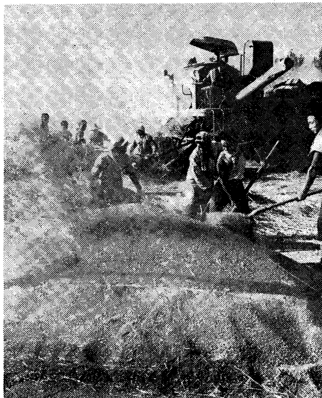
Students of the Tarim Institute of Land Reclamation at summer harvest

In the first year after its founding, the school reached self-sufficiency in grain, edible oil, meat and vegetables. To date, the teachers and students have reclaimed more than 5,000 mu of wasteland for cultivation and produced more than 4 million jin of grain and 450,000 jin of ginned cotton. With their own hands, they have built school buildings containing a floor-space of 14,000 square metres, opened up land for growing fruit and mulberry trees, set up farms for