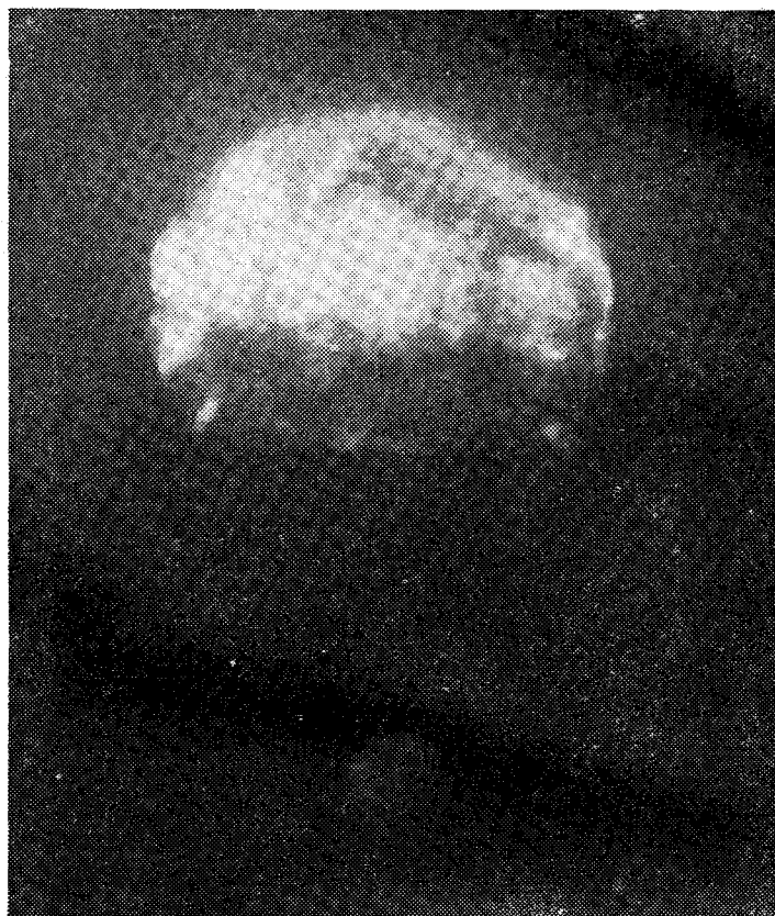
China's second nuclear explosion, 10:00 hrs., May 14, 1965