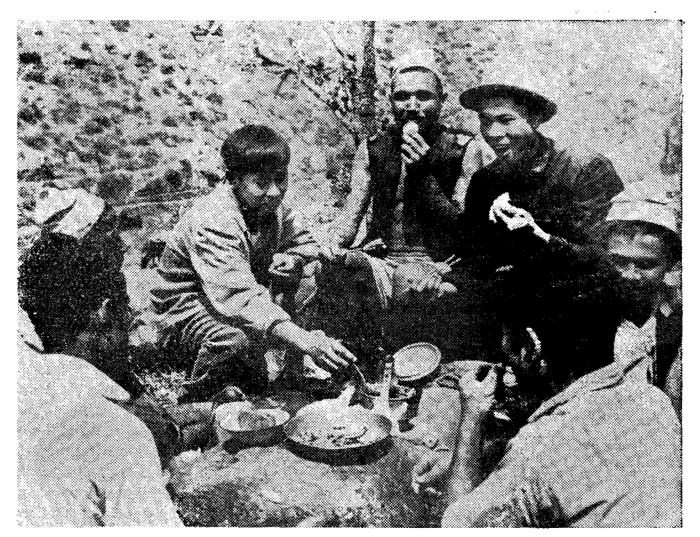
Chinese experts in Nepal and Nepalese workers take their meal together at a highway construction site

Another time, a Nepalese peasant's leg was severely crushed by rocks. A Chinese doctor had him moved to his own bed where he performed an operation on the mangled leg. Greatly concerned about his patient after the latter was sent home, the doctor covered about seven li and climbed 1,000metre-high mountains every day to change the dressings for the peasant. A month later, the leg