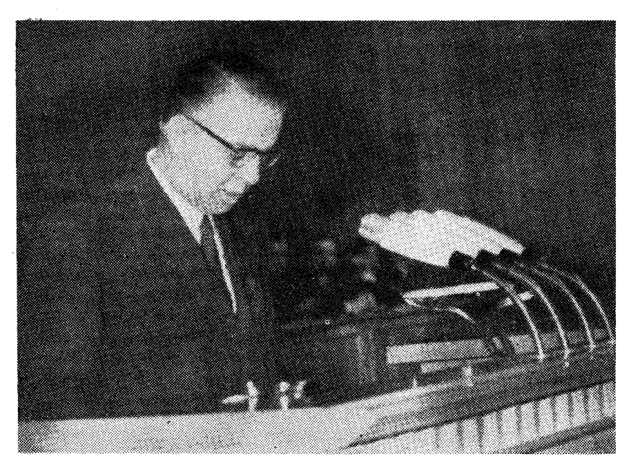
Enver Hoxha, First Secretary of the Central Committee of the Albanian Party of Labour, delivers the report on the work of the Central Committee at the Party's Fifth Congress

COMRADE ENVER HOXHA, First Secretary of the Central Committee of the Albanian Party of Labour, on November 1, made a speech at the Party's Fifth Congress on the work of the Party's Central Committee.