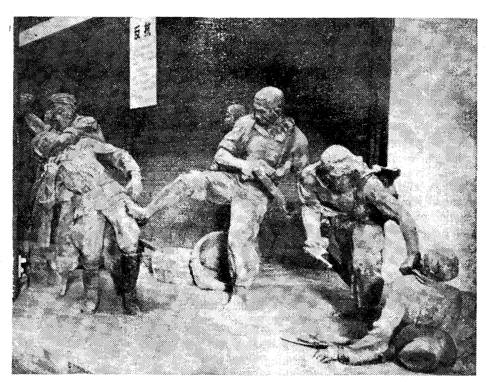
New figures in Rent Collection Courtyard: The awakened peasants in organized and well-led resistance seize arms from the landlords' guards

The compound was an arena of class struggle. It was a focal point of confrontation of the exploiter and the exploited, the oppressor and the oppressed. It was a gateway of life and death. The process of collecting rent in the courtyard was no simple business transaction. It was a process of the landlord class economically exploiting and politically oppressing the peasants. Class struggle was the very essence while paying and collecting rent was only a phenomenon. This was the "key."