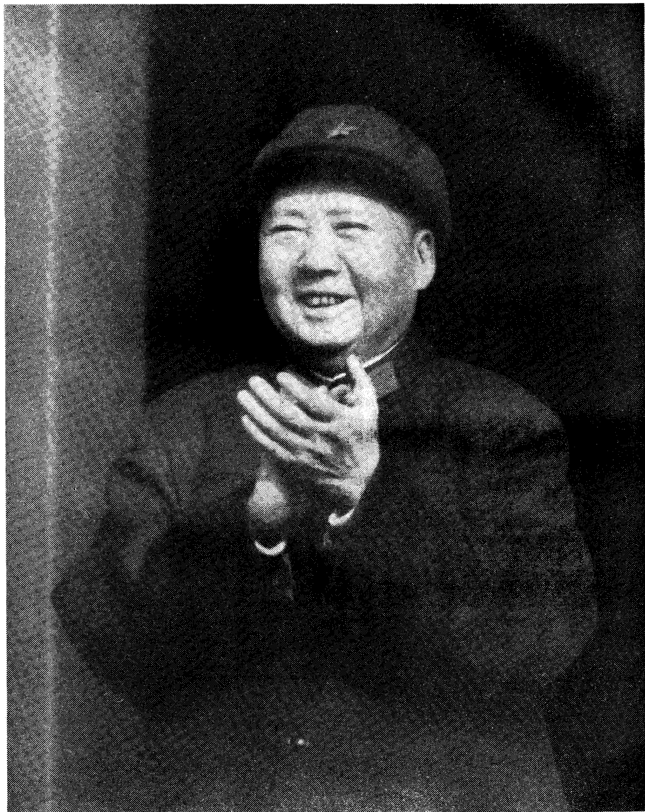
Chairman Mao Tse-tung

Our great teacher, great leader, great supreme commander and great helmsman