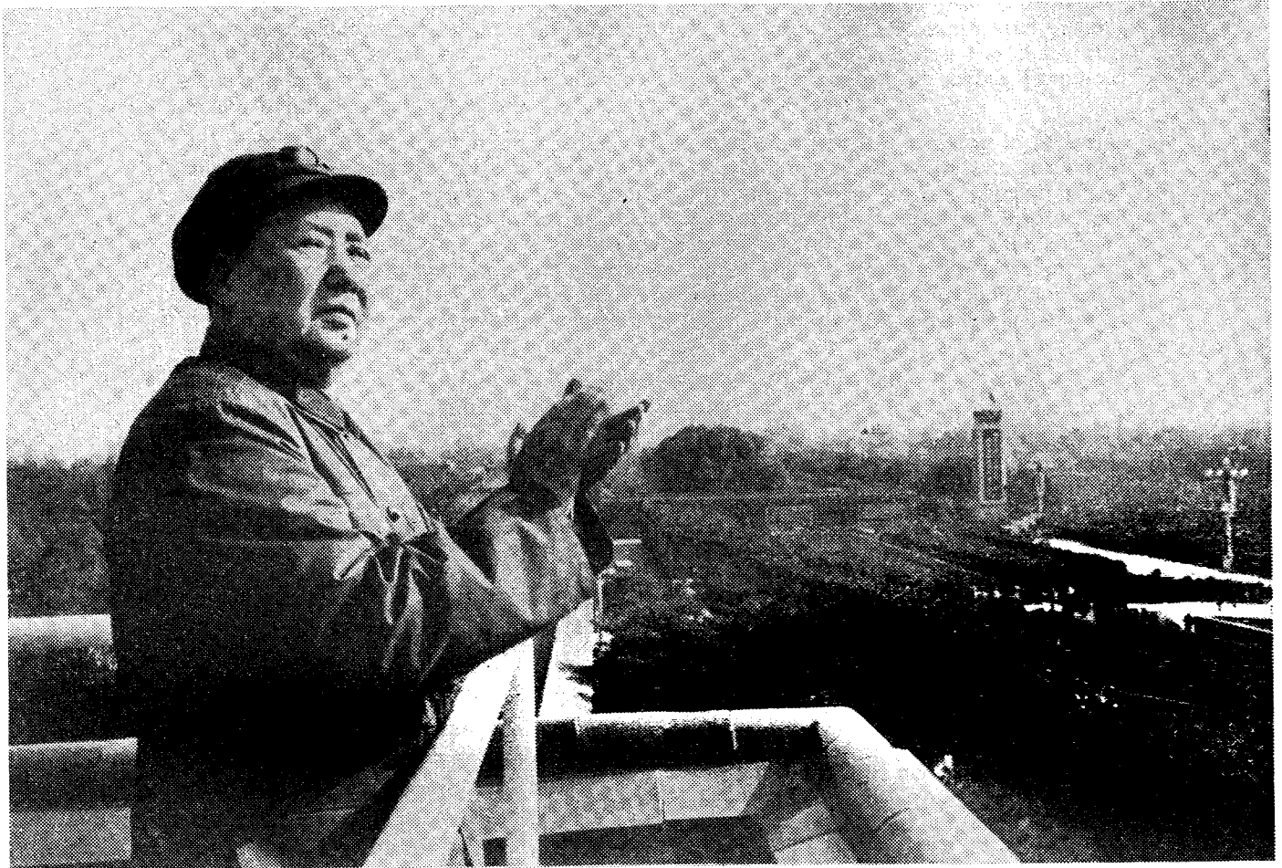
Chairman Mao Tse-tung

Our great teacher, great leader, great supreme commander and great helmsman