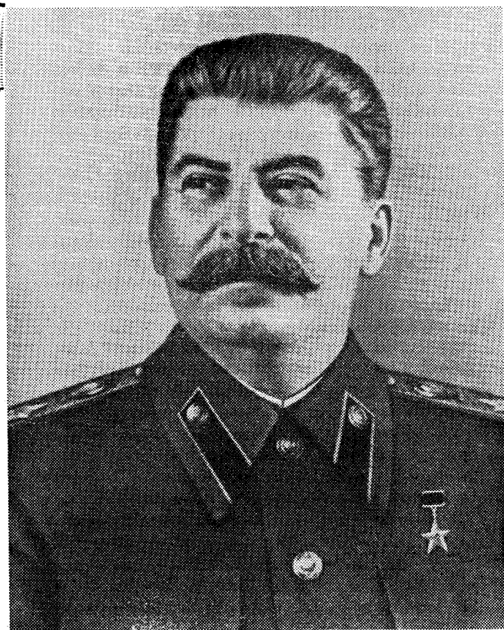
Stalin - the great Marxist-Leninist

the Soviet Union has become the centre of modern counter-revolutionary revisionism and another headquarters of the world's reactionary forces.