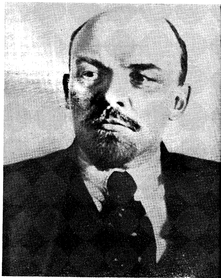
Lenin - the great teacher of the proletarian revolution

After Stalin's death, the Khrushchov revisionist group usurped the Party and state leadership, betrayed the October Revolution, betrayed Lenin and caused the socialist Soviet Union to change its political colour. Today, under the reactionary rule of Brezhnev, Kosygin and their ilk,