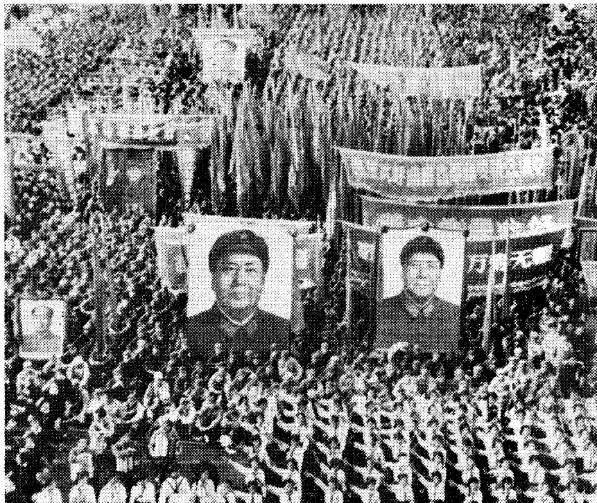
Armed men and civilians in Changsha warmly celebrate the birth of the Hunan Provincial Revolutionary Committee.

The Ningsia Hui Autonomous Region is a region through which Chairman Mao led the Workers' and Peasants' Red Army. Thirty-two years ago, Chairman Mao successfully crossed Liupan Mountain, the last in the Long March, and wrote Mount Liupan , a brilliant poem full of heroic and resolute sentiment. This poem and especially its famous lines — "High on the crest of Liupan Mountain our banners idly wave in the west wind" — have given tremendous inspiration and inexhaustible strength to Ningsia's revolutionary people of both the Hui and Han nationalities. At every crucial moment in the sharp struggle between the two classes, two roads and two lines and during the unprecedented movement of the great proletarian cultural revolution, the great leader Chairman Mao has charted in good time the course of advance for the revolutionary people of Ningsia. With the close concern shown by Chairman Mao and guided by his series of latest instructions, the proletarian revolutionaries, the revolutionary young Red Guard fighters and the revolutionary masses of