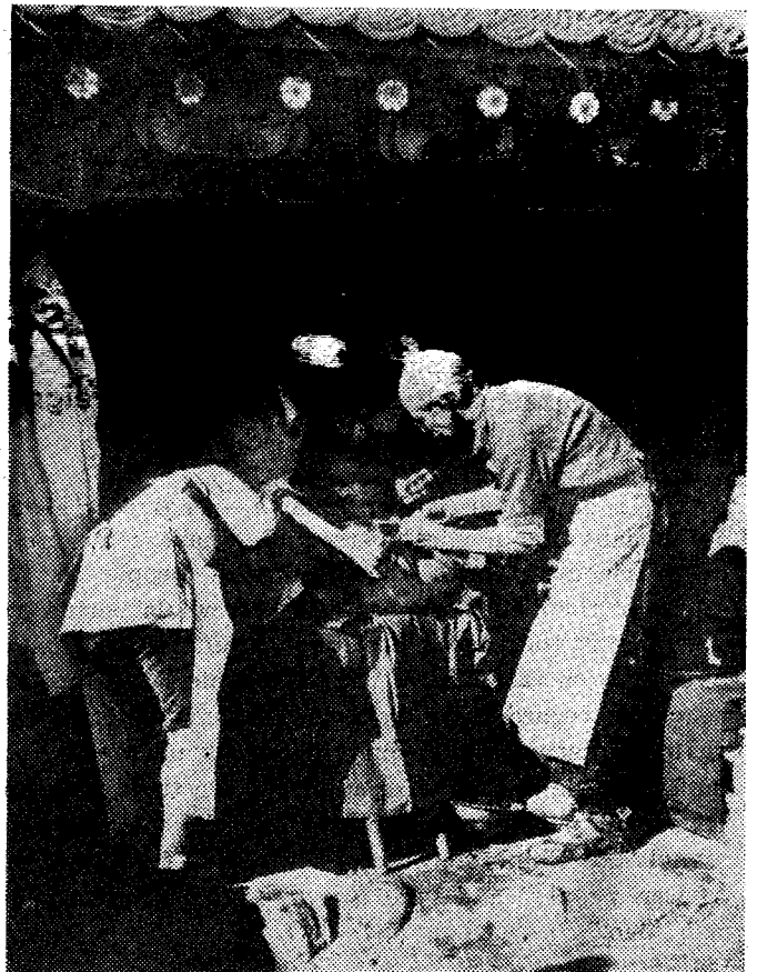
Dr. Bethune, who possessed profound class feelings for the Chinese people, operated on a wounded soldier on October 24, 1939 in an improvised operating theatre in a temple in Laiyuan County of the Shansi-Chahar-Hopei border area.

An oil painting at the exhibition captured the moment when the grey-haired Canadian Communist, this proletarian internationalist, gave his blood to a people's fighter, infusing him with new life.