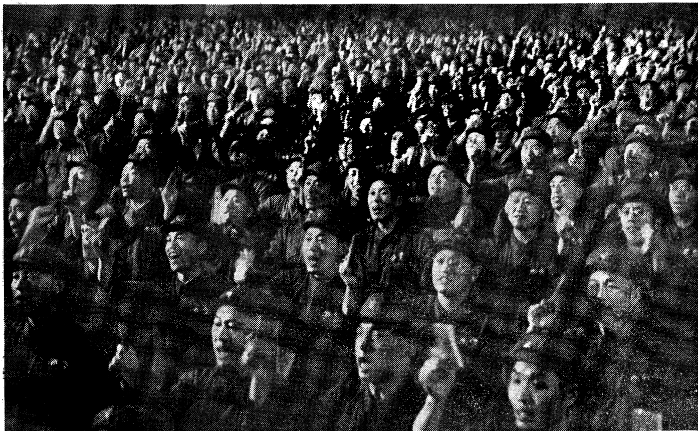
The hearts of the revolutionary fighters turn to the Party, to Chairman Mao. At this happiest of moments, they cheer with great elation: "Long live Chairman Mao!" "A long, long life to Chairman Mao!"

After the reception, the revolutionary fighters continued to cheer: "Long live Chairman Mao! A long, long life to him!" They sang Sailing the Seas Depends on the Helmsman and We Wish Chairman Mao a Long, Long Life .