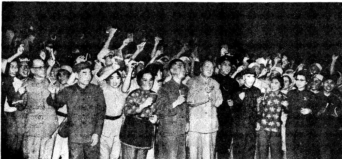
After the performance, Chairman Mao and Vice-Chairman Lin Piao and Comrades Chou En-lai, Chen Po-ta, Kang Sheng and Chiang Ching go on to the stage and are photographed with the performers.

OUR great teacher and great leader Chairman Mao and his close comrade-in-arms Vice-Chairman Lin Piao in the evening on July 1 attended a musical performance sponsored by the Cultural Revolution Group Under the Central Committee of the Chinese Communist Party in celebration of the 47th anniversary of the founding of the Party. They saw and listened to a performance of The Red Lantern , Peking opera sung to piano accompaniment, newly created during the great proletarian cultural revolution, and the symphonic work Shachiapang .