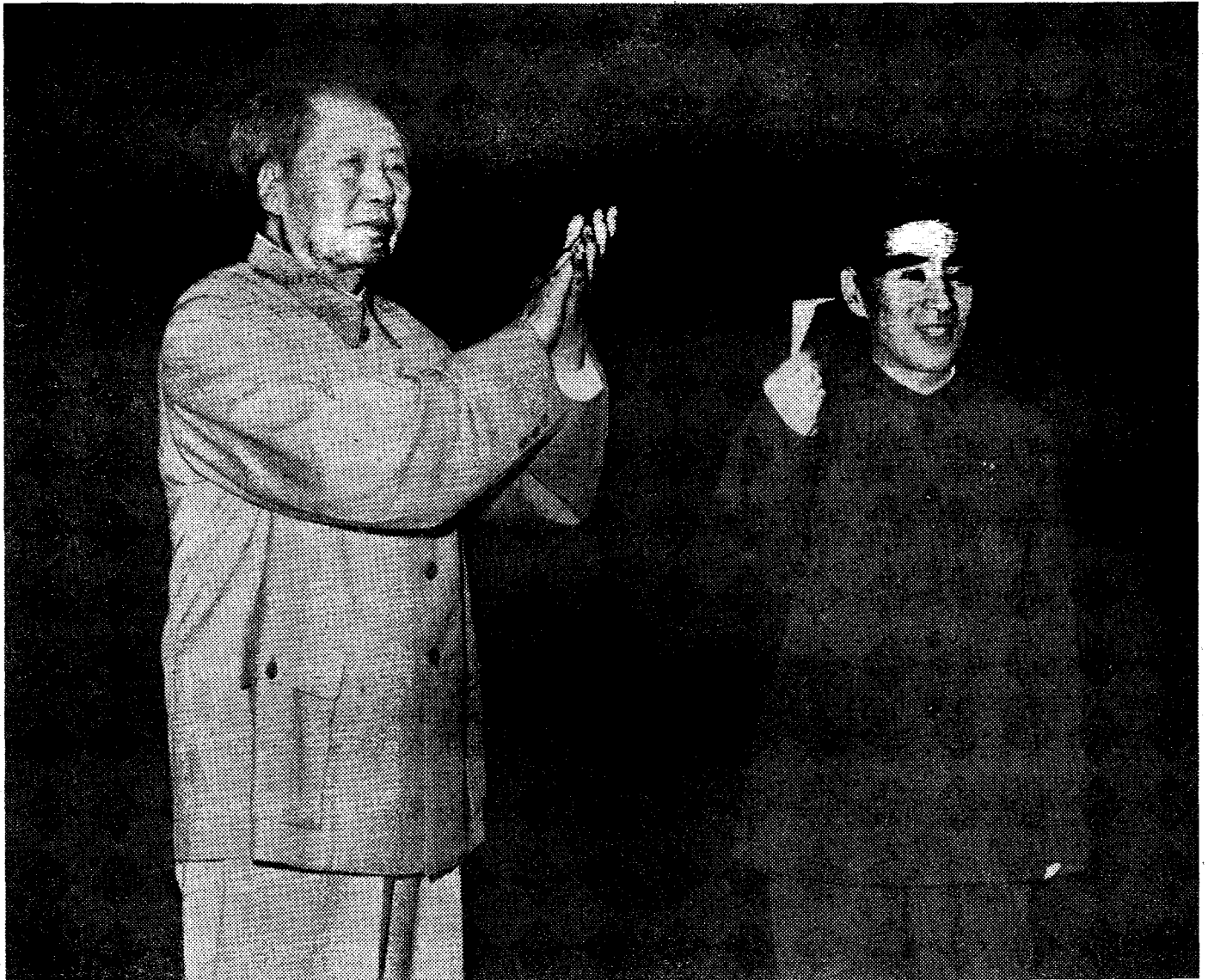
Chairman Mao and Vice-Chairman Lin Piao meet the revolutionary fighters with great happiness and warmth.

O UR most respected and beloved great leader Chairman Mao, his close comrade-in-arms Vice-Chairman Lin Piao and Comrades Chou En-lai, Chen Po-ta, Kang Sheng, Li Fu-chun, Chiang Ching,