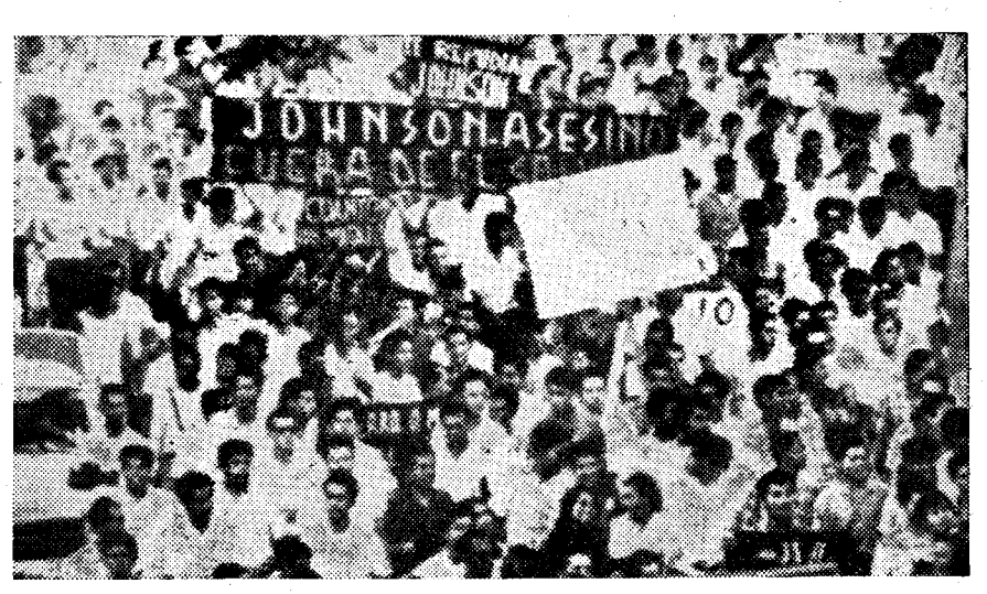
Holding placards one of which reads "Assassin Johnson get out of El Salvador," students demonstrate on the streets of San Salvador.

The momentous student movements have struck fear into the hearts of the ruling reactionaries. To suppress them, they have resorted to counter-revolutionary dual tactics by intensifying violent repression and engaging in political trickery. In Brazil, where the student struggle has been the fiercest and longest, the reactionary authorities "closed" and besieged the universities. They mobilized thousands of police and troops who carried out savage repression, using tear and other poisonous gases and fire-arms. At the same time, they hypocritically announced a phony order to the police not to interfere in the student demonstrations, and even appointed a "working team for educational reform" in a political swindle described as a "dialogue" to be held with the students. But the revolutionary students did not fall into the trap. They flatly rejected the proposed "dialogue" and called on the student masses "to take to the streets to combat the repression." They declared categorically that "only by meeting violence with violence can the Brazilian people win the struggle against imperialism."