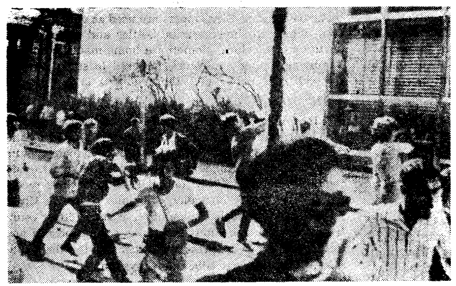
Angry Brazilian students throw stones at the U.S. embassy where panic-stricken Yankees dared not appear.

In some other countries, the ruling reactionaries have tried to use the local revisionists to wreck the student movements. However, the revisionist stooges