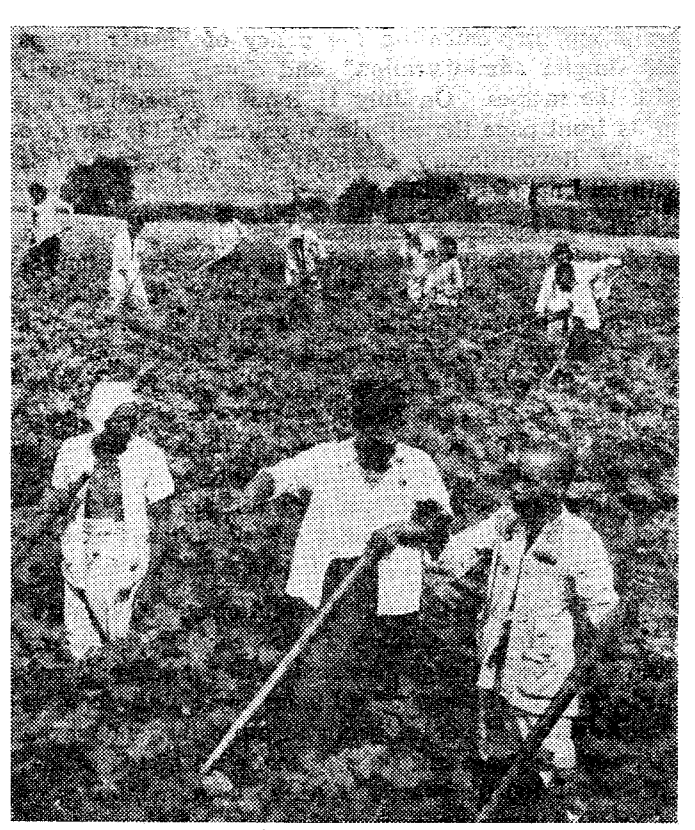
A leading member of the Lingpao County Revolutionary Committee (middle foreground) joins the poor and lower-middle peasants in farm work.

With the administrative structure of the county revolutionary committee simplified, the leading cadres also improved their style of work. They frequently went to the different sections and the grass-roots units to settle problems on the spot. They worked everywhere — under the trees, on the banks of the irrigation canals, in the office as well as in the streets — wherever the people sought them out and comrades wanted to consult them, and gave the latter replies and solutions.