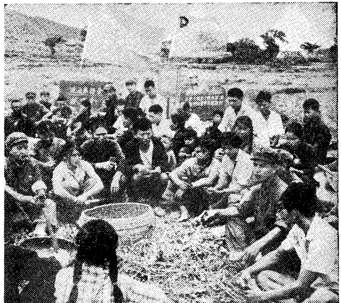
Commanders and fighters of the "Model Company in Cherishing the People" helping poor and lower-middle peasants near where they are stationed to run a Mao Tse-tung's thought study class. Here they are studying Chairman Mao's latest instructions together.

In the great struggle to defend the socialist revolution and socialist construction, the 4th company carried on the glorious tradition of the People's Liberation Army of simultaneously being a fighting force and a working force, as well as a production force. Wherever they go, they integrate closely with the local people. In the busy spring ploughing season, they help the poor and lower-middle peasants plant rice-seedlings. At harvest time, they help them bring in the rice. They help the masses to resist drought. They consider the masses'