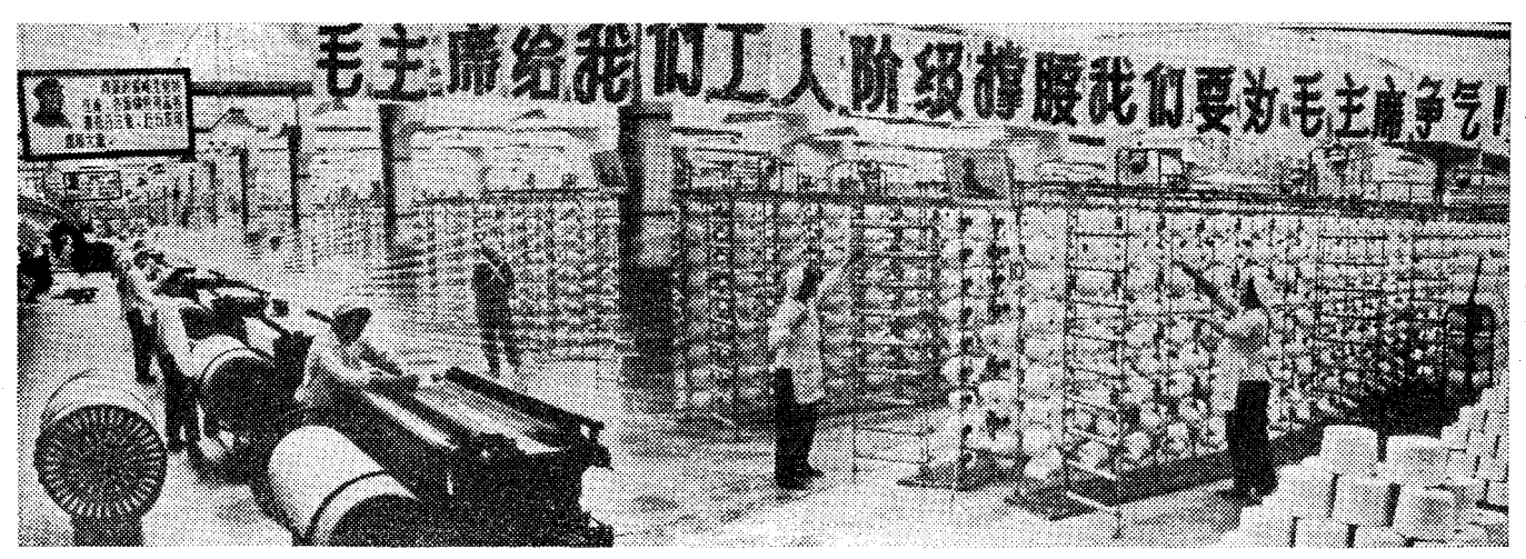
The Peking No. 3 Cotton Mill fulfilled its 1968 production plan ahead of schedule. Production goes ahead in the mill full steam.

designed, built and equipped by China went into production last year. Compared with 1966, more than twice as many new pits went into operation in 1968, and the number now under construction came to 13.4 per cent more than in 1966. By December 10, China's coal mines had done 68 per cent more tunnelling than in the same period in 1967.