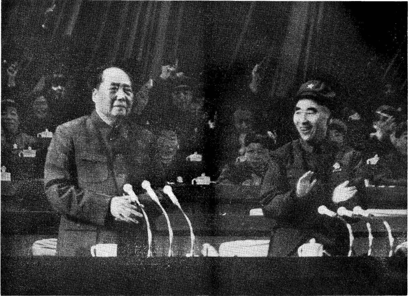
The great leader Chairman Mao and his close comrade-in-arms Comrade Lin Piao on the rostrum