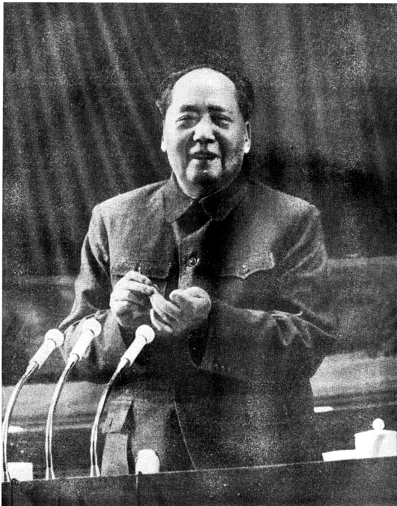
Our great leader Chairman Mao is making a most important speech at the Ninth National Congress of the Communist Party of China.